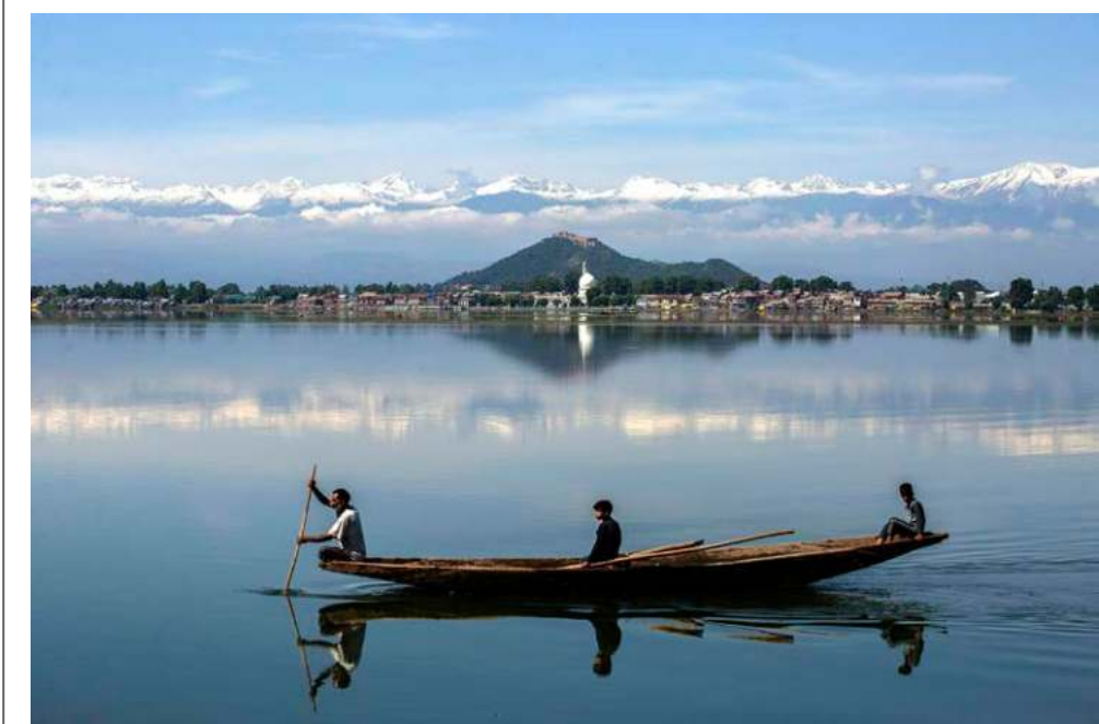
A SOLITARY SHIKARAWALA rowing his boat in the backdrop of iconic signposts and the majestic Pirpanjal mountain range in Srinagar's Dal Lake on Saturday.

Additional Secretary appreciated the efforts of the department for motivating the farmers towards adopting new initiatives for sustenance and improving their socio economic status.