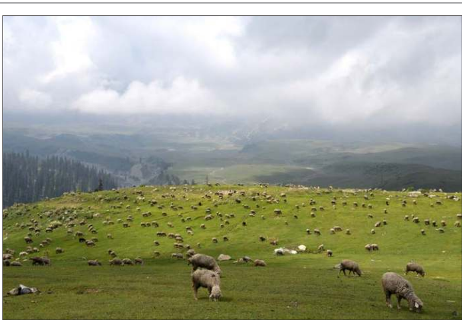
A HERD OF SHEEP GRAZING in the meadows of Tosa Maidan in central Kashmir's Budgam district.

Dr. Singla impressed upon AD Employment to bring more progressive youth under the ambit of the scheme by generating awareness among them. He also appealed to eligible youth to come forward and avail livelihood benefits under the scheme.