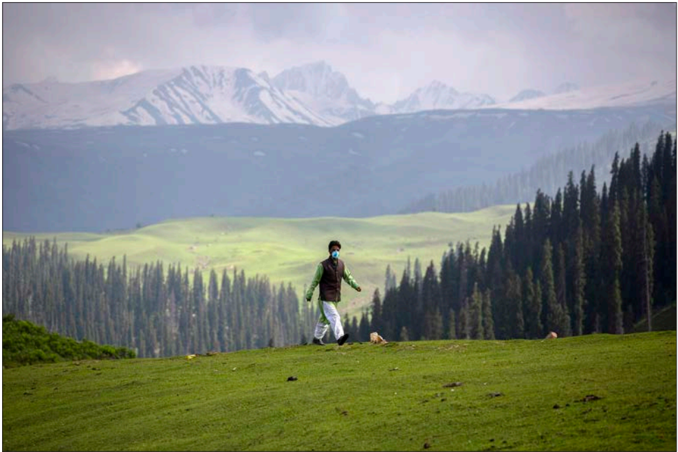
HEAVENLY HIGHLAND: Far from the madding crowd, lockdown-weary Kashmiris are arriving in Tosa Maidan to feel the meditative calm.