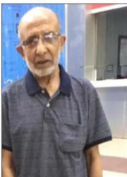
media line ads