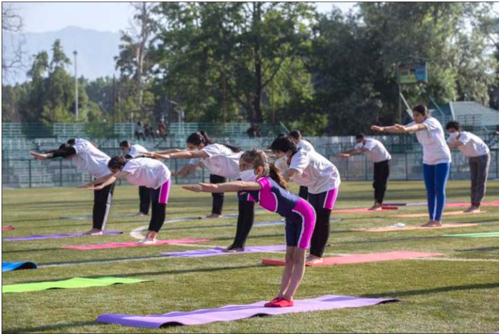
SCHOOL STUDENTS PERFORM YOGA to mark the 7th Yoga Day in Srinagar on Monday.