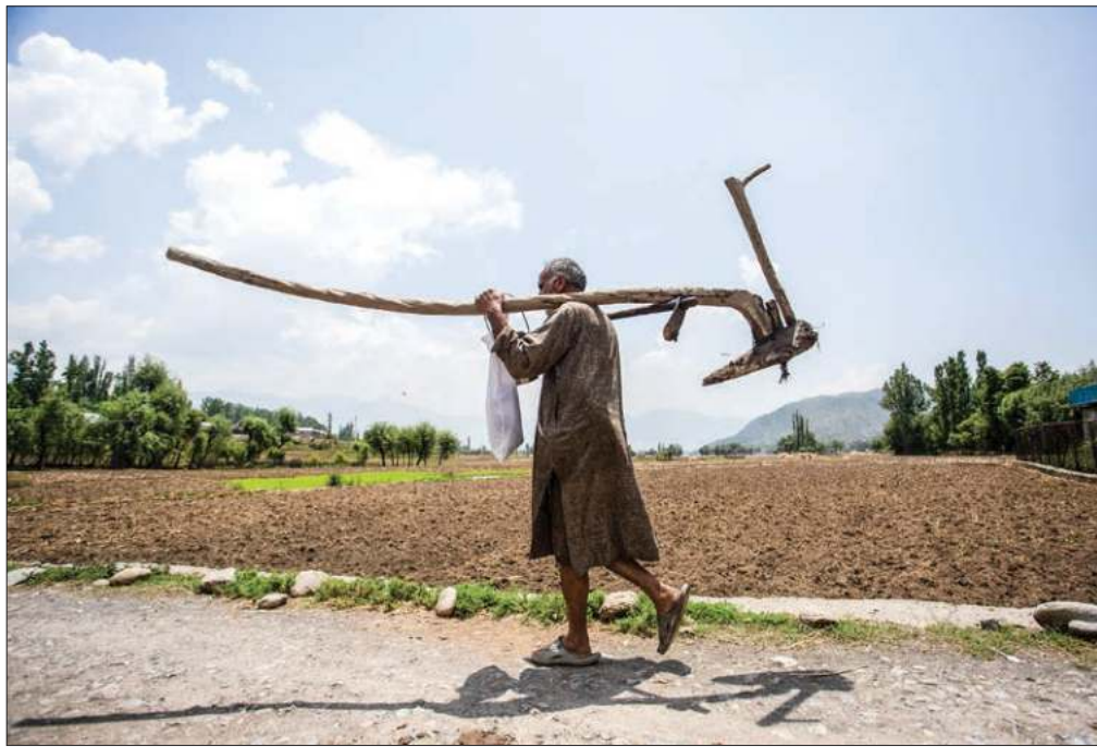
A farmer carrying wooden plough walks towards his paddy field in south Kashmir's Tral on Monday.