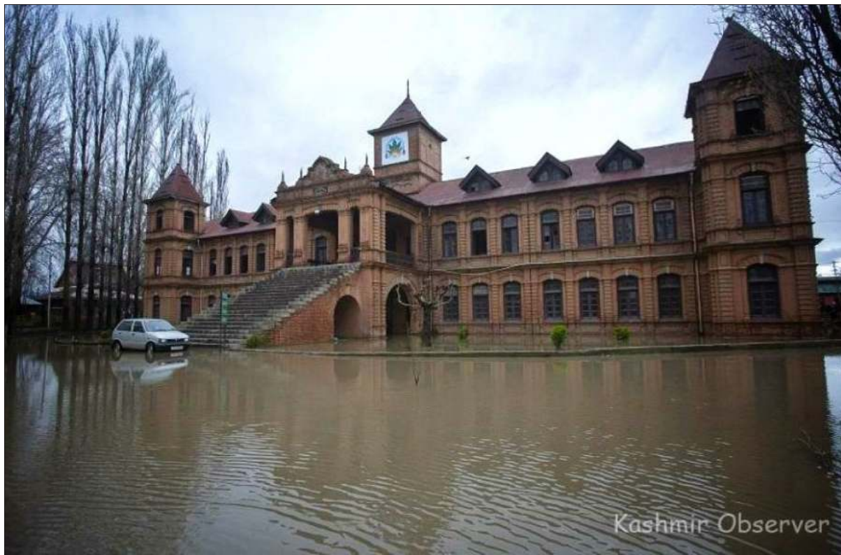
Flooded Amar Singh College, Srinagar, Jammu and Kashmir. Emblematic of the state academic culture of higher educational institutes in Kashmir