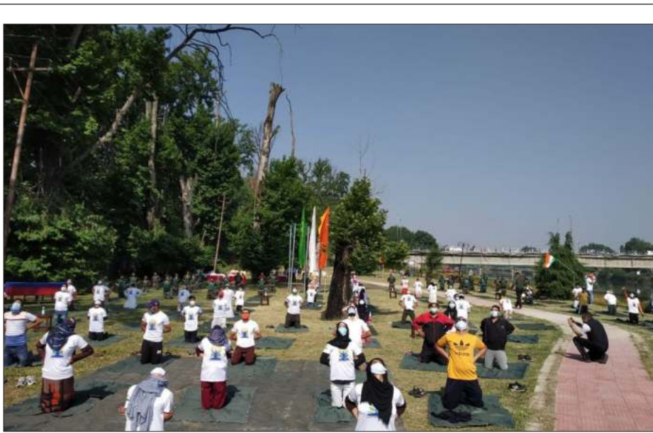
SHUGUL ORGANIZATION MONDAY held an event to mark Yoga Day at Zero Bridge In Srinagar at IDPS Zakura Srinagar in collaboration with Knovatic Help Foundation and FORTUNE Info-Media.