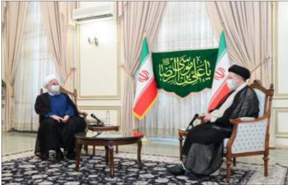
KO Web Desk

TEHRAN- Dressed in a black turban and cleric’s coat, Iranian ultra-conservative Sayed Ebrahim Raisi casts himself as an austere and pious figure and a corruption-fighting champion of the poor.