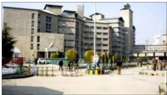
Observer News Service

SRINAGAR: The Jammu and Kashmir government is mulling to resume OPD services in all hospitals of Jammu and Kashmir as the covid graph has flattened.