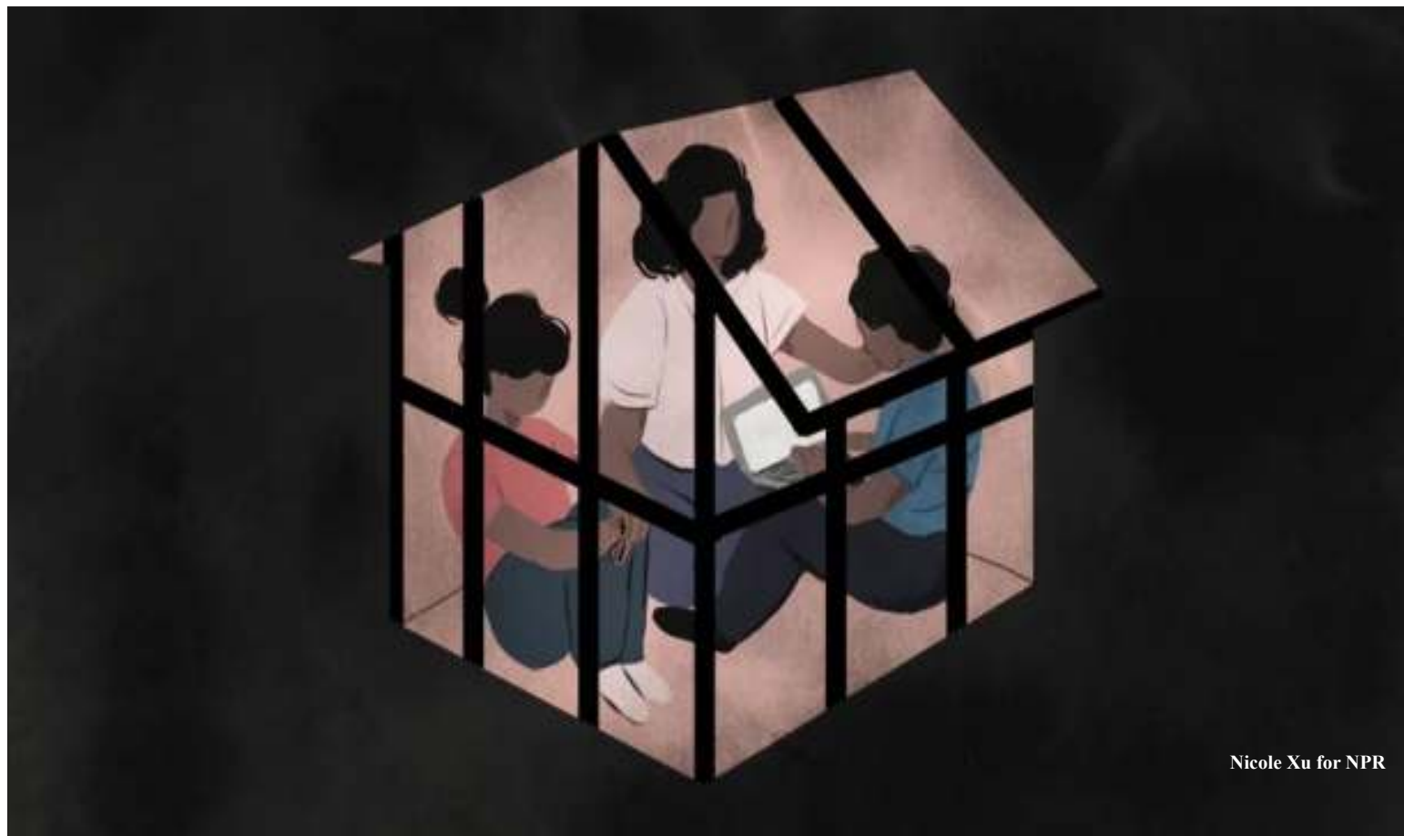
Nicole Xu for NPR

The other cardinal requirement is adaptability. Education systems around the world