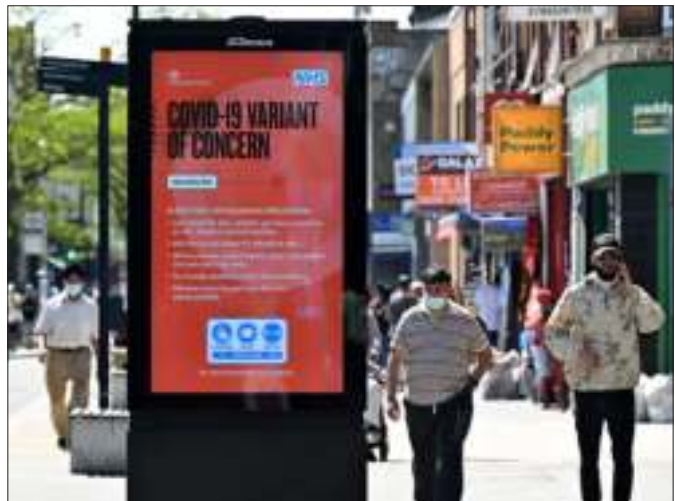
PRESS TRUST OF INDIA

WASHINGTON: The US Centers for Disease Control and Prevention has classified the Delta, a highly transmissible COVID-19 variant first identified in India, as a "variant of concern."