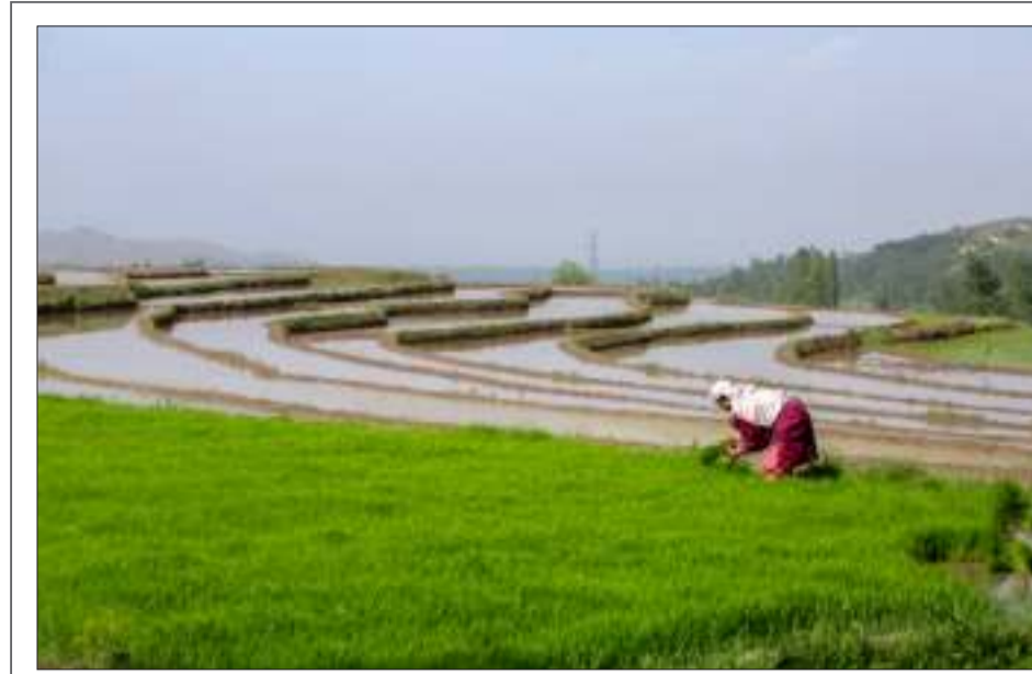
A WOMAN PLANTS PADDY SAPPLINGS IN KHAG AREA of Central Kashmir's Budgam district on Wednesday.

Evening and Door to door vaccination drives are also being carried out to achieve the cent percent target, DC added. He also stated that to detect the person to have contracted covid infection, aggressive testing is being carried out on a daily basis.