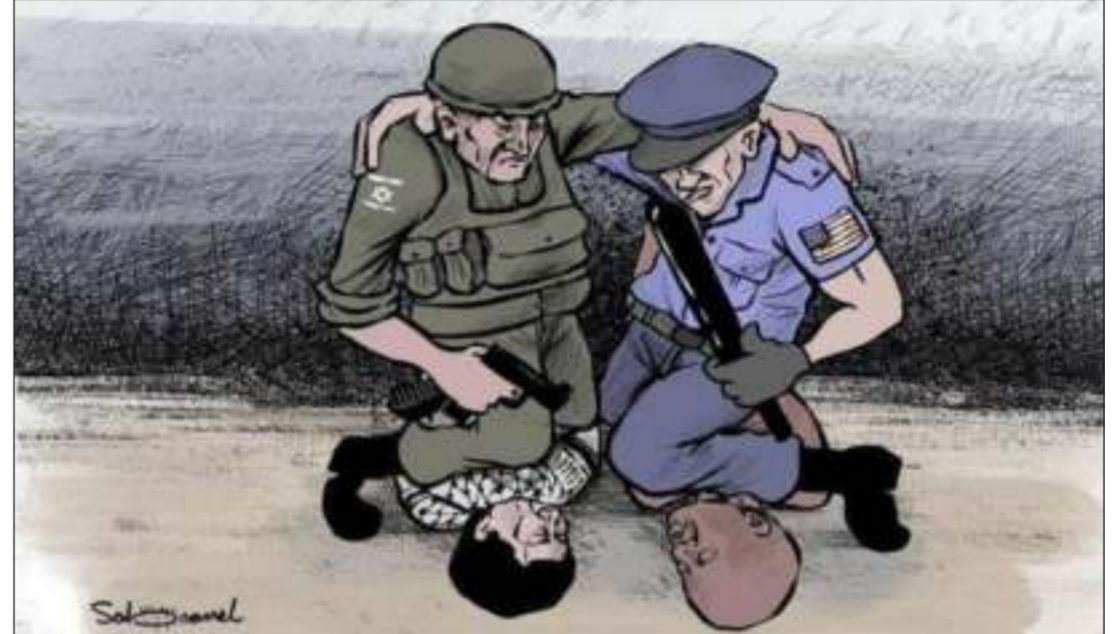
Activist art draw parallels between police brutality in U.S. and Israel

Surely, you see the similarities in Black and Palestinian whose struggles has been through the paradigm of militarization, occupation and destruction like in Gaza, the mass open prison reduced to rubble?