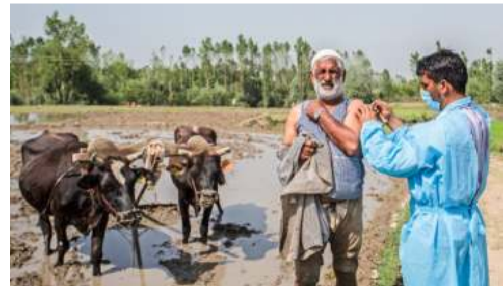
A health worker administers Covid-19 vaccine jab to a farmer at a paddy field in Khag area of Budgam district on Wednesday.