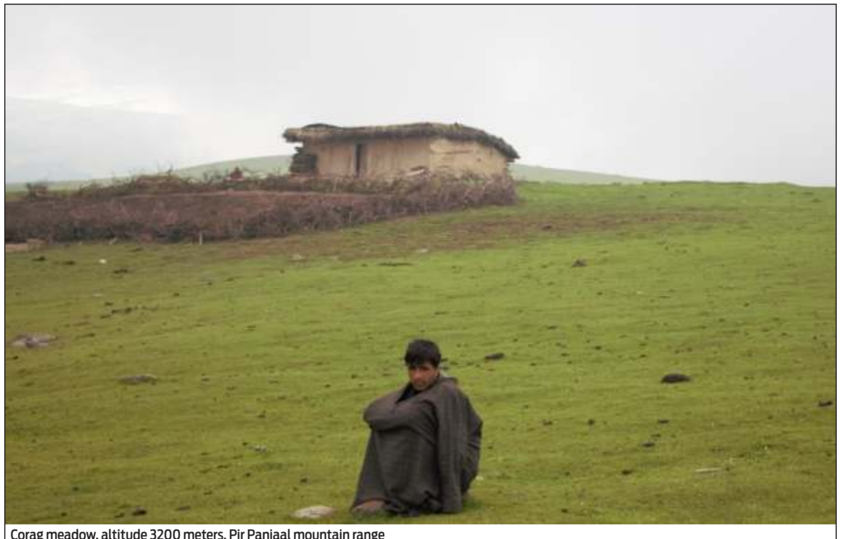
Corag meadow, altitude 3200 meters, Pir Panjaal mountain range