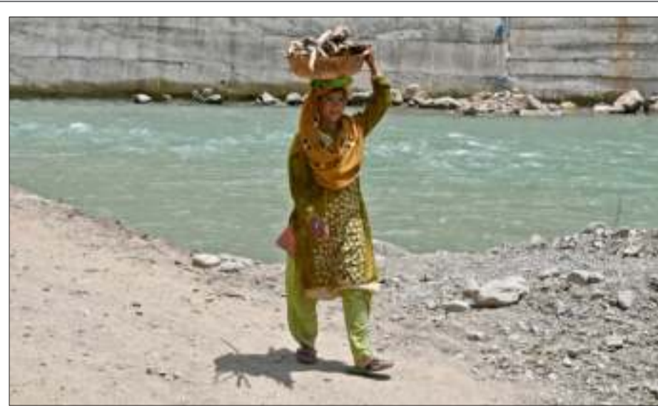
A WOMAN IN NORTH KASHMIR'S BANDIPORA walks along the banks of a river, carrying firewood on her head Tuesday afternoon.