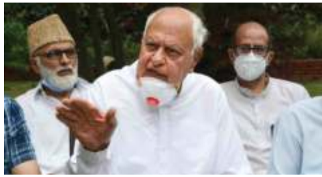
restoration of Article 370 met in the backdrop of the raging rumours. But the minutes of the meeting turned out to be a

feelers and signals till a month ago has now started shaping up as the quiet talks," the leader says. "But let me tell you, the political dialogue is still work in progress." The indications of the possible return of the political trope in Kashmir valley came when Dr. Farooq Abdullah-led Peoples' Alliance for Gupkar Declaration (PAGD) regrouped in the Fairview residence of Mehbooba Mufti on June 9 this year. The seven-party group formed last year for the