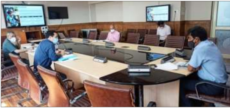
Observer News Service