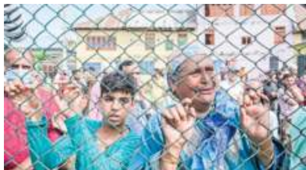
An elderly woman breaks down during the funeral of a civilian killed in Sopore shootout on Saturday.

Police Officer Among 3 More Injured In Exchange Of Fire