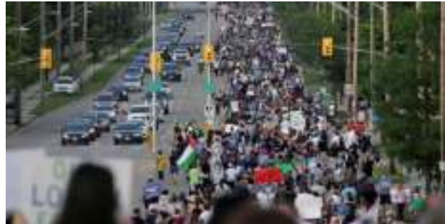
was arrested by police.

People in London, Ontario marched about 7 kilometers (4.4 miles) from the spot where the family was struck down to a nearby mosque, the site close to where Veltman