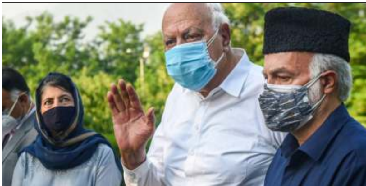
MP and President of National Conference (NC) Farooq Abdullah and PDP chief and former Chief Minister Mehbooba Mufti after a meeting of Peoples Alliance for Gupkar Declaration (PAGD), in Srinagar, Wednesday, June 9, 2021.

Extensive concealment of governmental processes is characteristic of the authoritarian regimes, but democratically-elected governments also resort to secrecy, though efficacy of such attempts may be weakened due to certain legal frameworks (such as the right to infor-