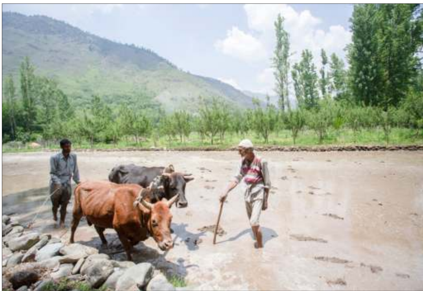
Farmers ploughing their paddy field in a village in Tral area of south Kashmir's Pulwama district on Friday.