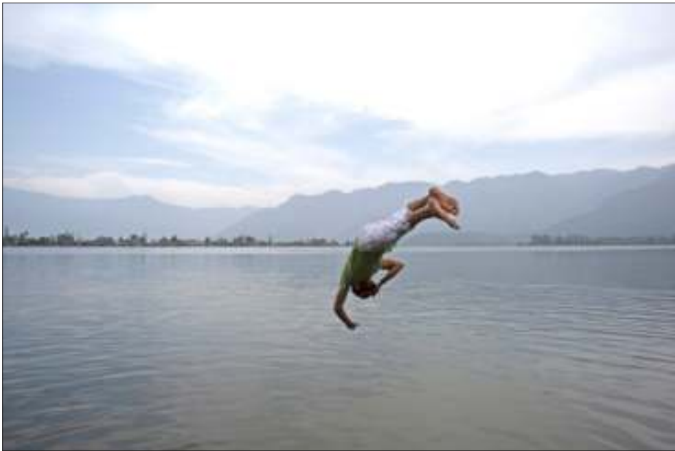
A BOY JUMPING into Dal Lake to beat the heat in Srinagar on Friday.