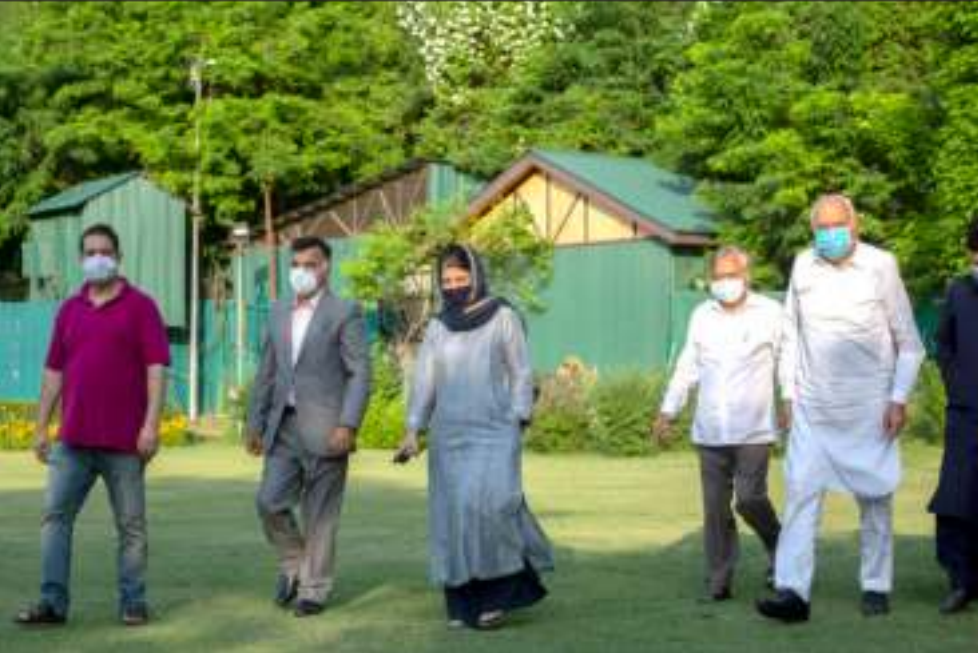
NATIONAL CONFERENCE PRESIDENT DR FAROOQ ABDULLAH and Peoples Democratic Party President Mehbooba Mufti walking in the lawns of the laters' house at Gupkar in Srinagar, ahead of the PAGD meeting.

He also reiterated his appeal to the people living in the jurisdiction of Dal and Nigeen Lakes to refrain from indulging in illegal construction and any sort of encroachment.