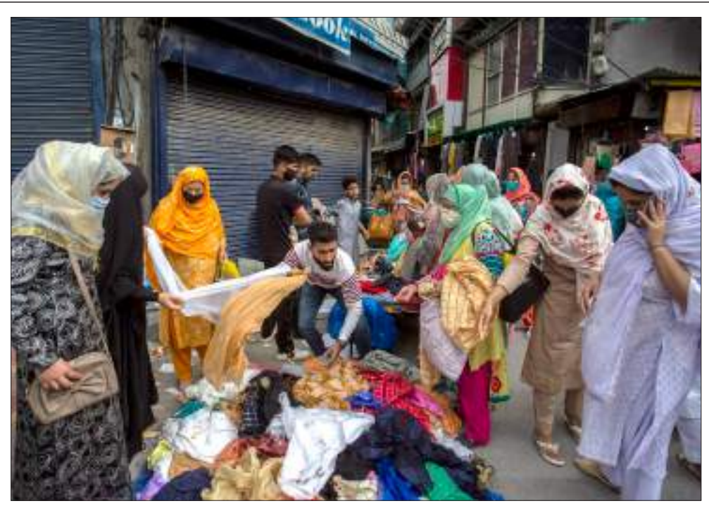
SHOPPERS THRONGED MARKETS in capital city Srinagar on Thursday as shops opened partially.