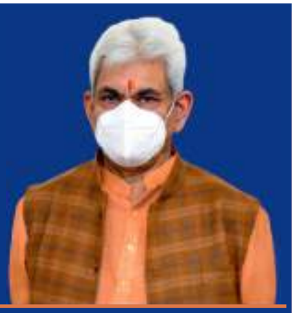
Shri Manoj Sinha Hon'ble Lieutenant Governor