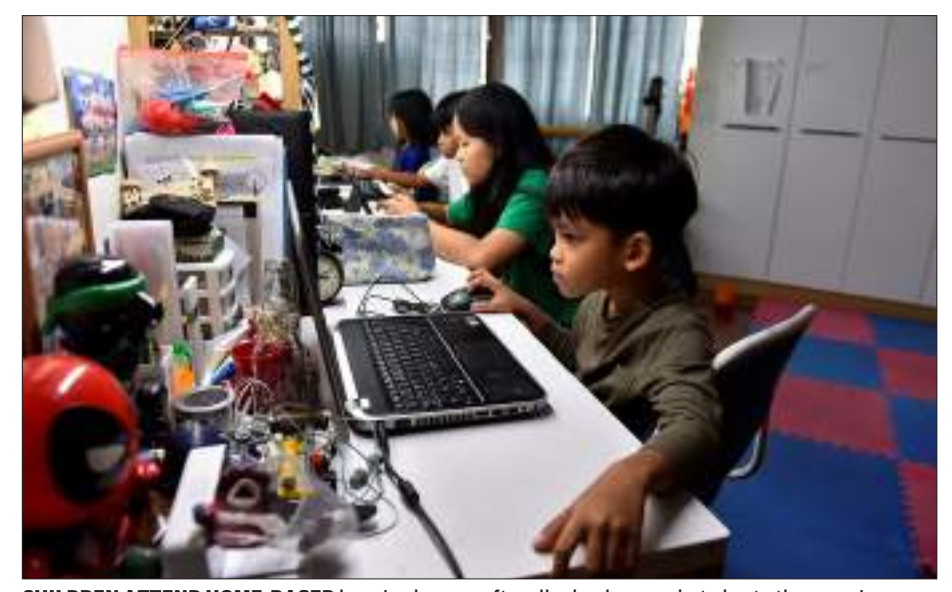
CHILDREN ATTEND HOME-BASED learning lessons after all schools were shut, due to the surge in Covid-19 in Singapore on May 20, 2021