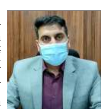
WE HAVE SEEN a visible decline in

The DC Said any laxity on Covid SOPs can prove harmful. He urged the left out population markets, the DC said that with