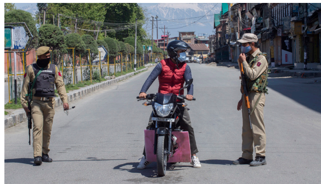
Cops stop a motorcyclist during corona imposed curfew in Srinagar

SRINAGAR: Terming timely testing, tracking, treatment and isolation as the way forward to defeat the coronavirus pandemic, the Jammu and Kashmir administration on Wednesday asked officials to penalise people disregarding the Covid-19 guidelines and jeopardizing public health. Chairing a meeting to review Covid containment measures including the progress of vaccination drives, Chief Secretary, Arun Kumar Mehta reiterated the 'zero-tolerance' policy of the government towards Covid inappropriate behavior and asked the department to promote its awareness among general masses through wider IEC