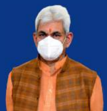
Shri Manoj Sinha Hon'ble Lieutenant Governor