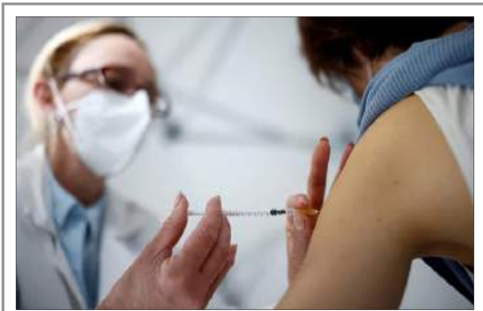
"DON'T THINK THE COVID-19 pandemic is over," WHO's regional director for Europe said (File)