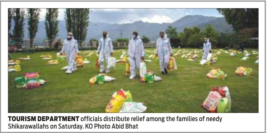
TOURISM DEPARTMENT officials distribute relief among the families of needy Shikarwallahs on Saturday.

on June 5 the government had presented these anti-farmer laws as ordinances." Jayprakash Narayan had at a public meeting in Patna's Gandhi Maidan on June 5, 1974, asked the people of Bihar to observe the day as 'Sampoorna Kranti Divas' (Total Revolution) and then form a 'janata sarkar' in every village to usher in a new social order. "The SKM has decided that on June 5, 'Sampoorna Kranti Divas' will be observed all over the country. We appeal to citizens to burn the copies of three agricultural laws in front of offices of BJP MPs, MLAs and representatives... make it a mass movement and force the government to repeal the farm laws," the umbrella body of protesting farmers unions added. The protesting farmers on Saturday also paid tribute to former prime minister Chaudhary Charan Singh on his death anniversary and remembered his contribution for the development of agriculture, farmers and villages. -PTI