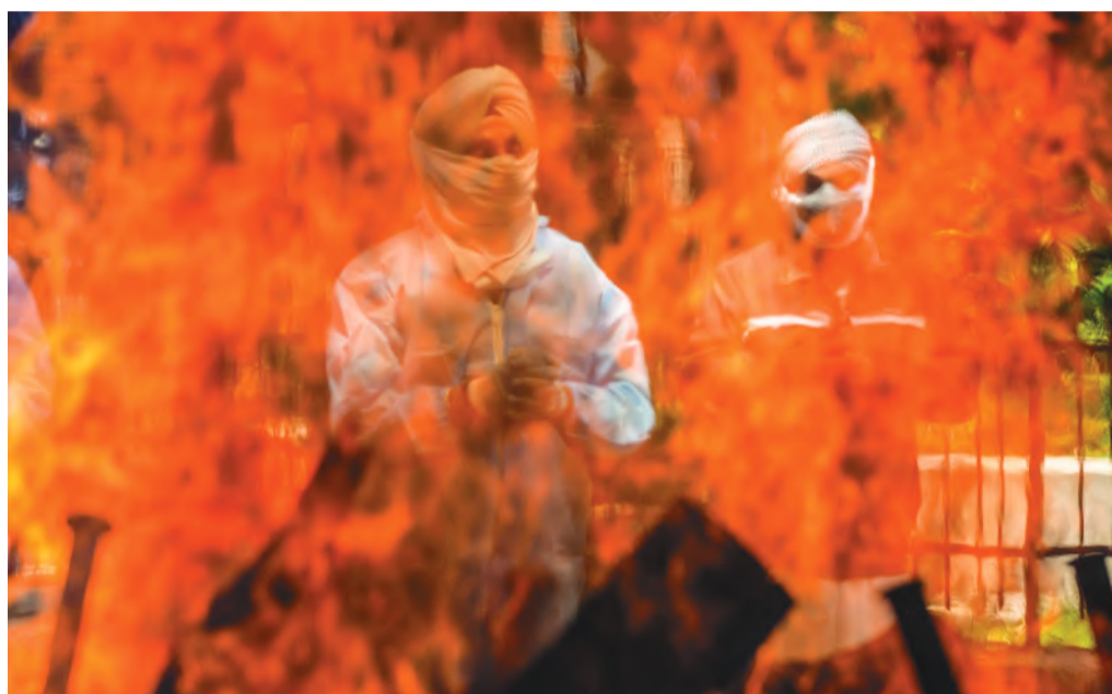
Relatives of a corona victim fold their hands while performing last rites at a cremation ground in Srinagar on Friday.

UDHAMPUR: A pesticide factory was gutted in a fire in the industrial area of Jammu and Kashmir's Udhampur district, officials said on Friday, adding no casualties were reported in the incident. It broke out in Dhanuka chemical factory at Batal-Ballian industrial estate around midnight on Thursday, they said, adding eight fire tenders were pressed into service along with the army and the air force. The fire engulfed the whole pesticide factory, which was one More On P6