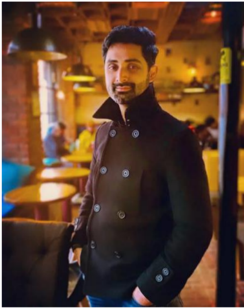
A portrait of the sketch-comedian.