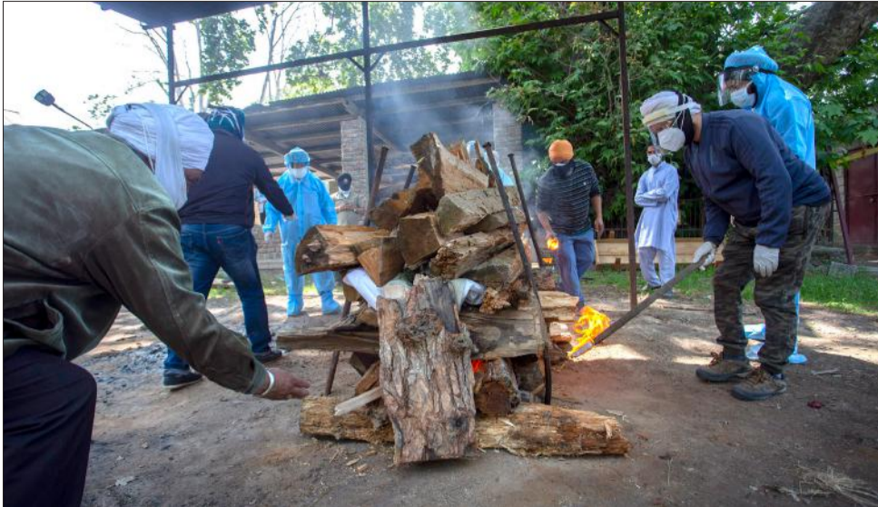
THE RELATIVES OF A PERSON WHO DIED OF covid-19 perform his last rites in Srinagar on Friday.

The drive against the violators of Covid-19 guidelines/ rules continued throughout all the districts of Kashmir Valley to ensure that people adhere to SOPs/ guidelines envisaged by government to curb COVID-19 pandemic, police said in a statement.