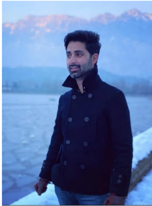
During recreational times.

"Everything is political in Kashmir," he said a few seconds before recording his show. "People in Kashmir have always done satire depending on what political bent they maintained based on which they could shape their performance. I think my satire is shaped as per political ideology of majority of Kashmiris."