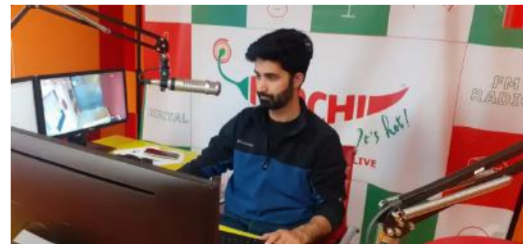
Recording the show.