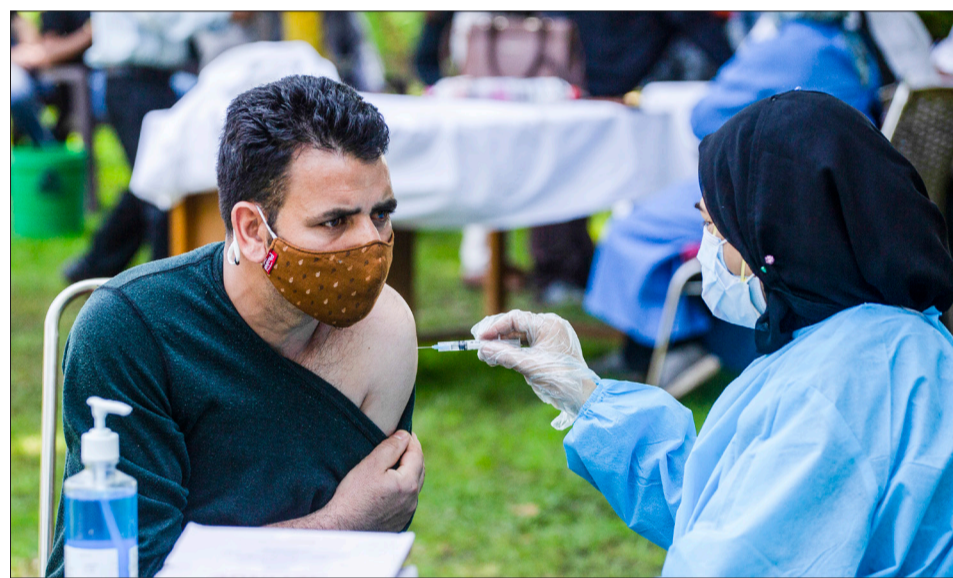
A paramedic administering Covid-19 vaccine shot to a man at a healthcare facility in Srinagar on Tuesday.