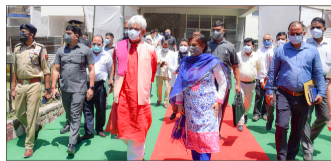
responsibility to ensure the availability of necessary medicare facilities, besides putting in best efforts. More On P10