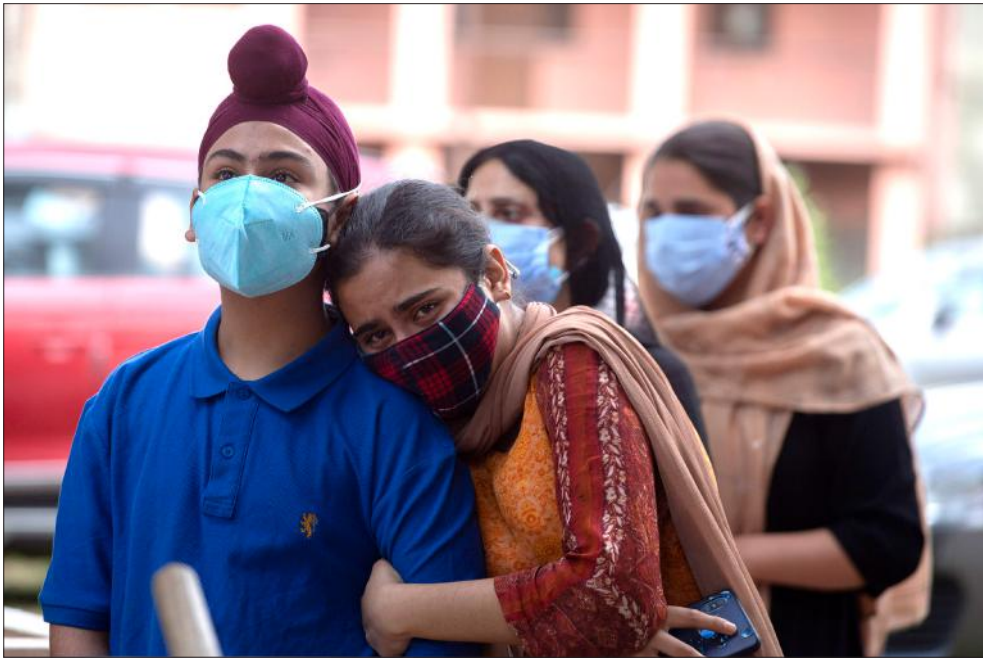
A SIKH FAMILY MOURNS THE DEMISE of their family member, who died of Covid-19, in Srinagar on Tuesday.