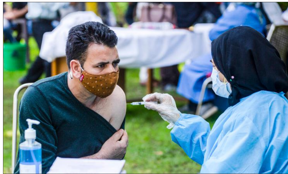
A paramedic administering Covid-19 vaccine shot to a man at a healthcare facility in Srinagar on Tuesday