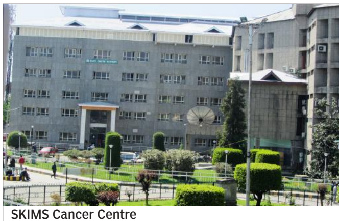
SKIMS Cancer Centre

The doctors devised a treatment plan and the patient was immediately put on a standard induction protocol. Meanwhile, desperate and without proper guidance, the family decided to take the patient to the Tata Memorial Hospital (TMH), Mumbai. At the TMH, the waiting for the transplant was nine months which the family could ill afford. The TMH offered another option— Sir Ganga Ram Hospital, New Delhi. The hospital authorities agreed for the transplant but after a month. The tentative cost of the procedure was put at fifteen lakhs rupees.