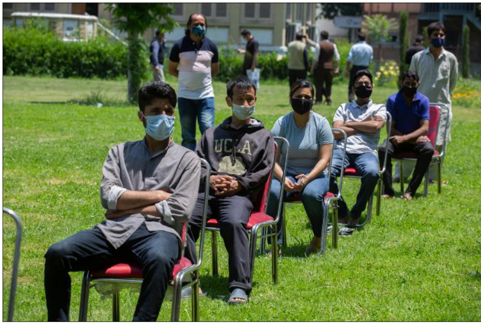
PEOPLE QUEUE UP IN A HEALTHCARE facility to get a jab of Covid-19 vaccine in Srinagar on Tuesday.

"Recently, in The Lancet, an international group of physicians and medical mycology societies laid down recommendations for diagnosing Aspergillus infections in COVID-19 patients, including doing lung imaging scans and taking samples from the lungs at regular interval for testing. The guidelines will help doctors treating Covid-19 patients know whether they're battling one deadly pathogen, or two," the statement added.