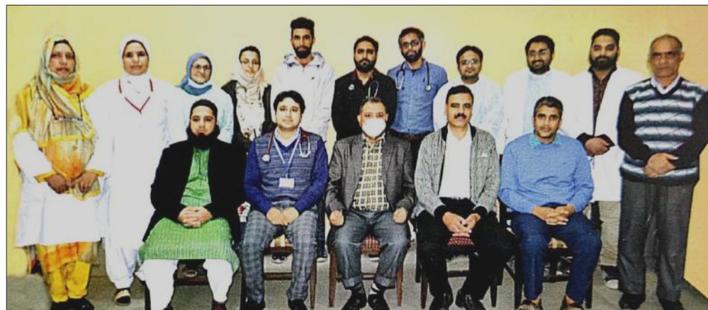
Medical Oncology and Stem Cell/Bone Marrow Transplant Team

The department has successfully performed similar transplants in more than seventy patients involving different cancers like multiple myeloma, non Hodgkins lymphomas, Hodgkins