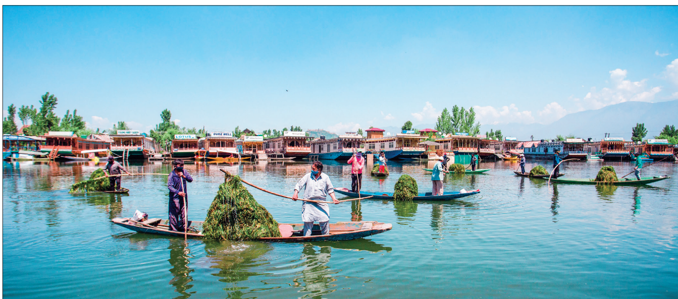
As the revival of tourism season seems far from sight in wake of corona surge, the administration has again shifted focus on de-weeding famous Dal Lake.

Jaishankar said the then Prime Minister Rajiv Gandhi's visit in 1988 to China 26 years after the 1962 conflict led to a consensus on having stability along the frontier which was followed by the. More On P10