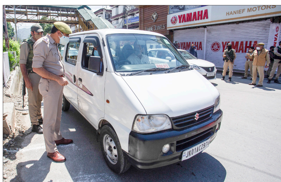
KO Photo: Abid Bhat

The twin advertisements read that the application as per prescribed format should reach the office of. More On P10