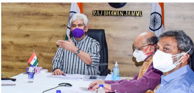
The decision was taken as a part of the Covid Containment measures after a detailed assessment of the present Covid scenario in the UT done by the Lieutenant Governor, Manoj More On P10

JAMMU: The Corona Curfew imposed in all 20 Districts of J&K till 7 am on Monday, 17th May, 2021 is extended further till 7 am on Monday, 24th May, 2021. The curfew will be strict except for a few essential services. Other restrictions and SOPs for weddings etc. outlined by the administration earlier will remain in force.