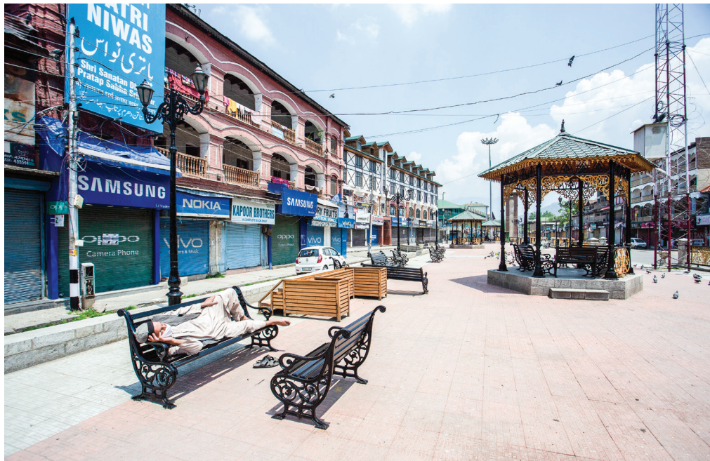
Basking in the sun at Lal Chowk: A man is seen taking a nap in the deserted commercial hub of Srinagar- KO photo.

The top court took note of its March 23, 2020, order by which it had directed all states and UTs to constitute high-powered committee (HPC) to consider releasing on parole or interim bail prisoners and the under trials for offences