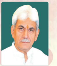
Shri Manoj Sinha Hon'ble Lieutenant Governor of J & K

MISSION YOUTH J&K (MY J&K) An Endeavour to Empower