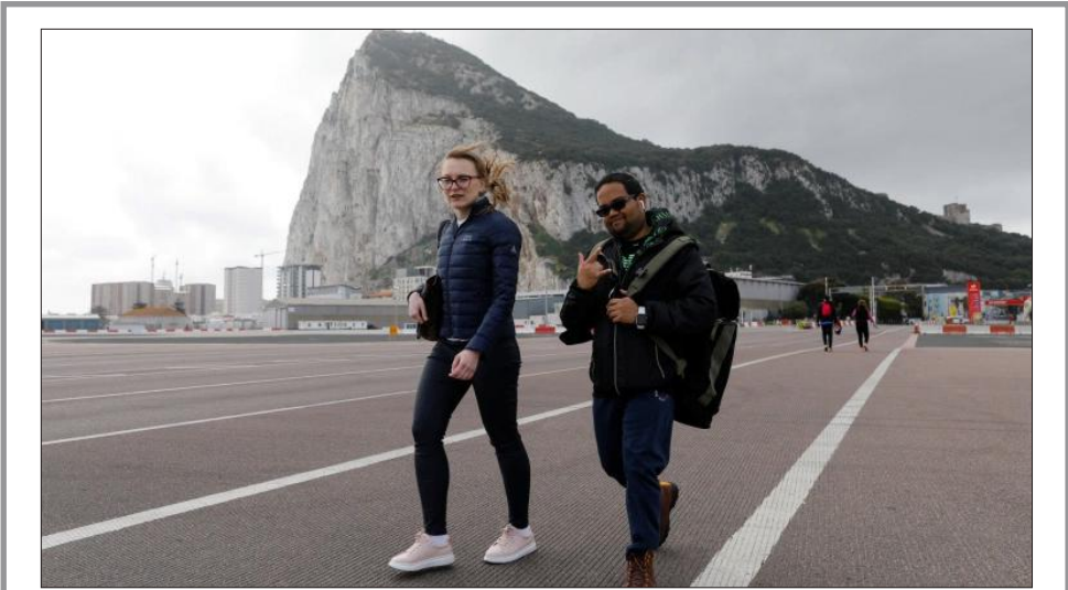
Residents walk without face masks while crossing the tarmac of the Gibraltar International Airport near the Spanish border, as from March 28 the British territory eased mask usage outdoors

“I DON’T THINK IT WOULD BE FAIR TO suggest these penalties in their most extreme forms are likely to be placed anywhere but this is a way to ensure we can prevent the virus coming back.”