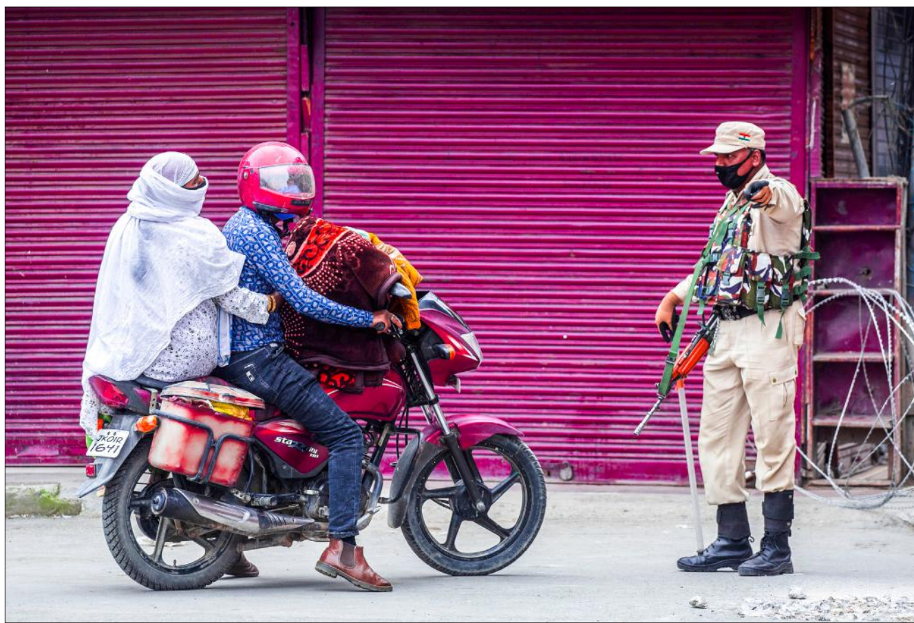
A CRPF man halting a motorcyclist during coronavirus imposed curbs in the Old City of Srinagar on Tuesday.

According to minutes of a meeting chaired by divisional commissioner Jammu on March 27, it was decided that DC Samba alongwith local military authorities will visit Deon village for joint inspection. They will also ● More On P10