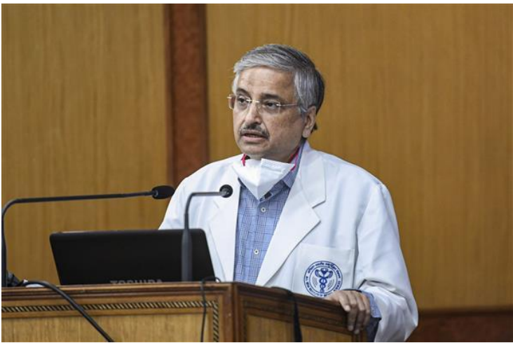
There is a need to impose strict regional lockdowns in areas where the COVID-19 case positivity rate is over 10 per cent or the bed occupancy is above 60 per cent to break the chain of transmission. The COVID-19 task force has also been advising for the same.

New Delhi: A strict lockdown should be imposed in areas where the COVID-19 case positivity rate is over 10 per cent or the bed occupancy is above 60 per cent, AIIMS Director Dr Randeep Guleria said on Tuesday, while stressing that clamping such restrictions all over the country cannot be a solution, keeping in mind people's livelihood. He rejected the strategy of imposing night curfews and weekend lockdowns by some states to reduce the number of coronavirus cases, saying "these would not have much of an impact on the transmission cycle". "There is a need to impose strict regional lockdowns in areas where the COVID-19 case positivity rate is over 10 per cent or the bed occupancy is above 60 per cent to break the chain of transmission. The COVID-19 task force has also been advising for the same. "It is there in the guidelines of the home ministry, but it is not being strictly implemented," Guleria told PTI. He said there should be a gradual, graded unlocking in such areas once the positivity rate reduces. However, he stressed that there should be restrictions on people travelling from areas that have a high positivity rate to places with a low positivity rate to curb the spread of the infection. On his views about a nation-