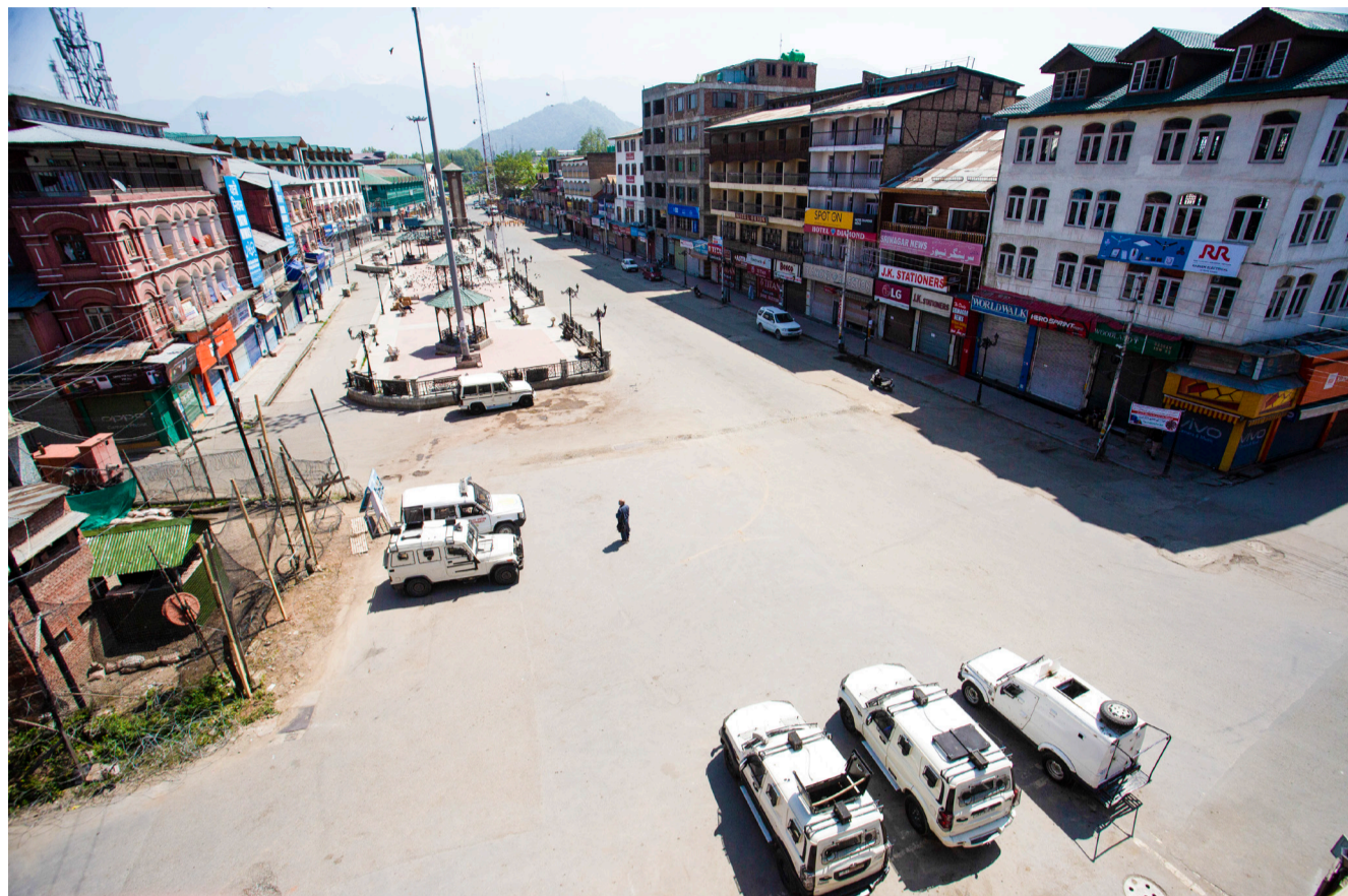
City's commercial hub Lal Chowk on Friday wore a deserted look due to a lockdown imposed to tackle coronavirus spread.