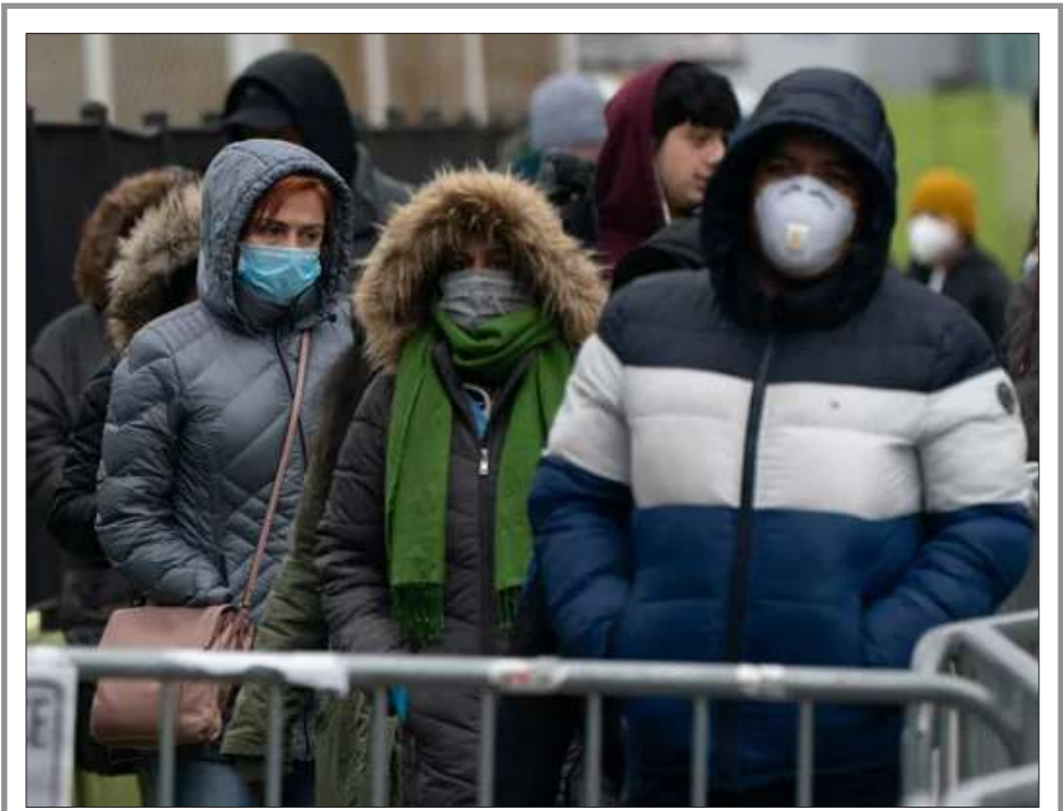
Masks are still necessary for vaccinated people if they are at concerts, large sporting events.