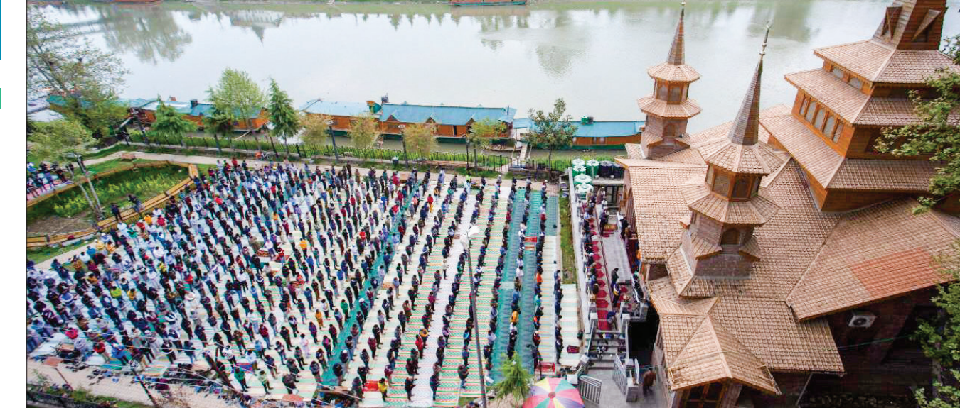
Devout Muslims bow before the Almighty on 2nd Friday of the holy month of fasting at a mosque on the Bund Srinagar.