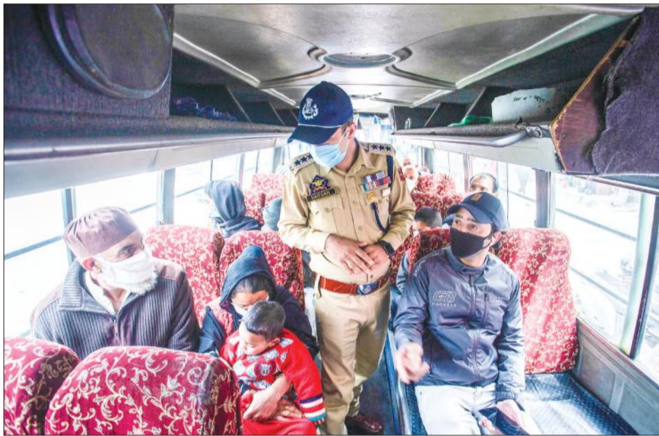
A police officer inspecting a passenger vehicle for Covid-19 SOPs adherence in Srinagar's Lal Chowk on Wednesday.