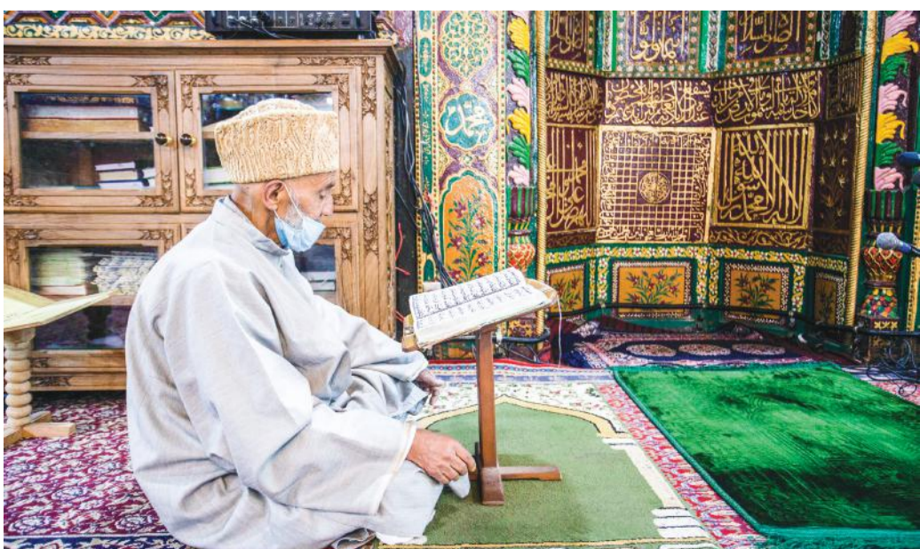
An elderly man reciting the holy Quran inside the 14th century shrine of Mir Syed Ali Hamadani in Khanqah-e-Moula locality of Old City on Wednesday.

The order further says that Additional Director General of Police (CID) has been nominated as Chairman of the committee and Inspector General of Police, Jammu/Kashmir, Representative of Home Department not Member below the rank of Additional Secretary, Representative of Department of Law, Justice Member & Parliamentary Affairs not below the rank of Additional Secretary and Representative