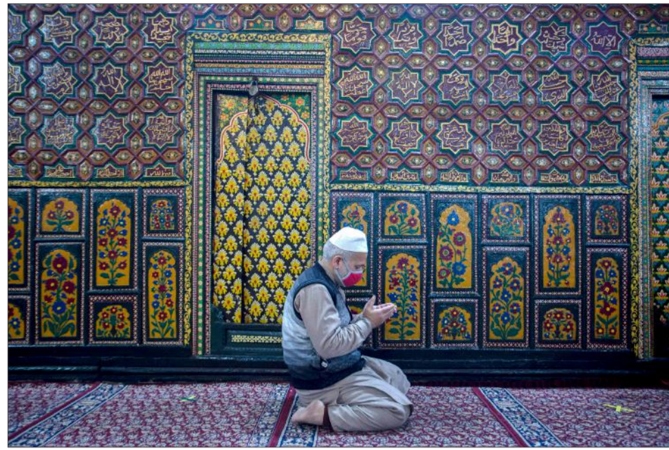
A MASKED MAN PRAYING INSIDE 14TH CENTURY KHANQAH-E-MOULA, also known as Shah-e-Hamadan Masjid, as coronavirus resurgence cast its shadow on the vibrant Ramadan gatherings in the valley.