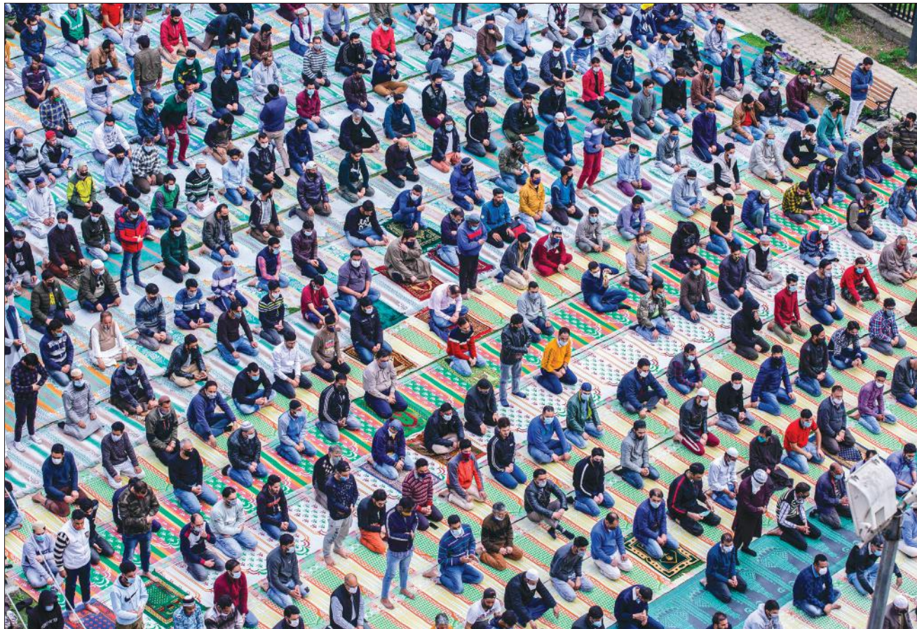
Adhering to the government issued Covid-19 guidelines; devotees offer Zuhr prayers on the first day of Ramazan in Srinagar on Wednesday.