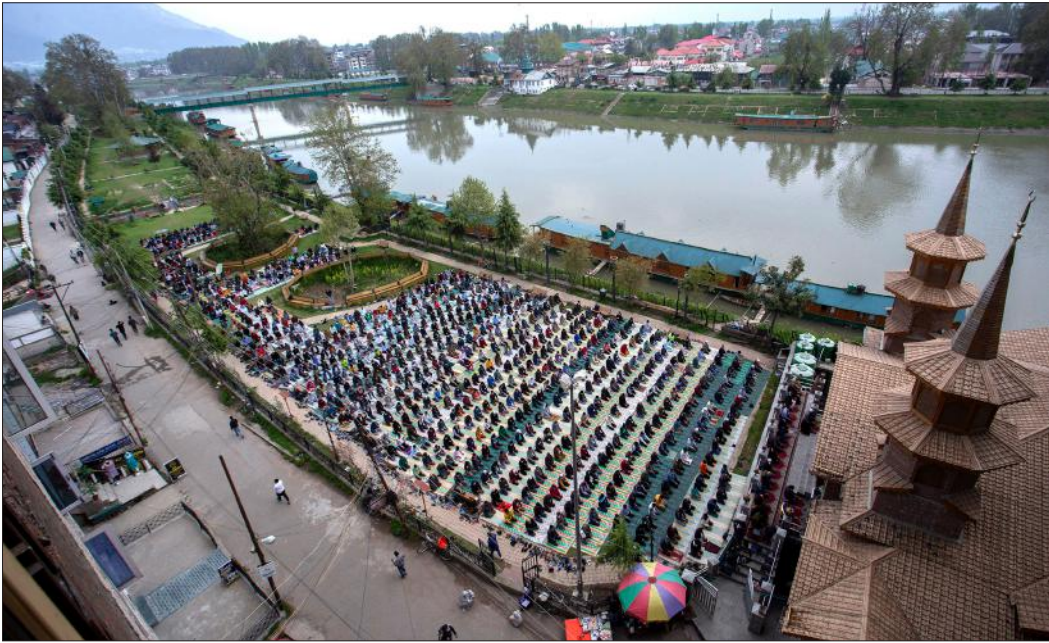
WORSHIPPERS, MAINTAINING SOCIAL DISTANCE, offer mid-day prayers at Masjid Bilal on The Bund in Srinagar on Wednesday.