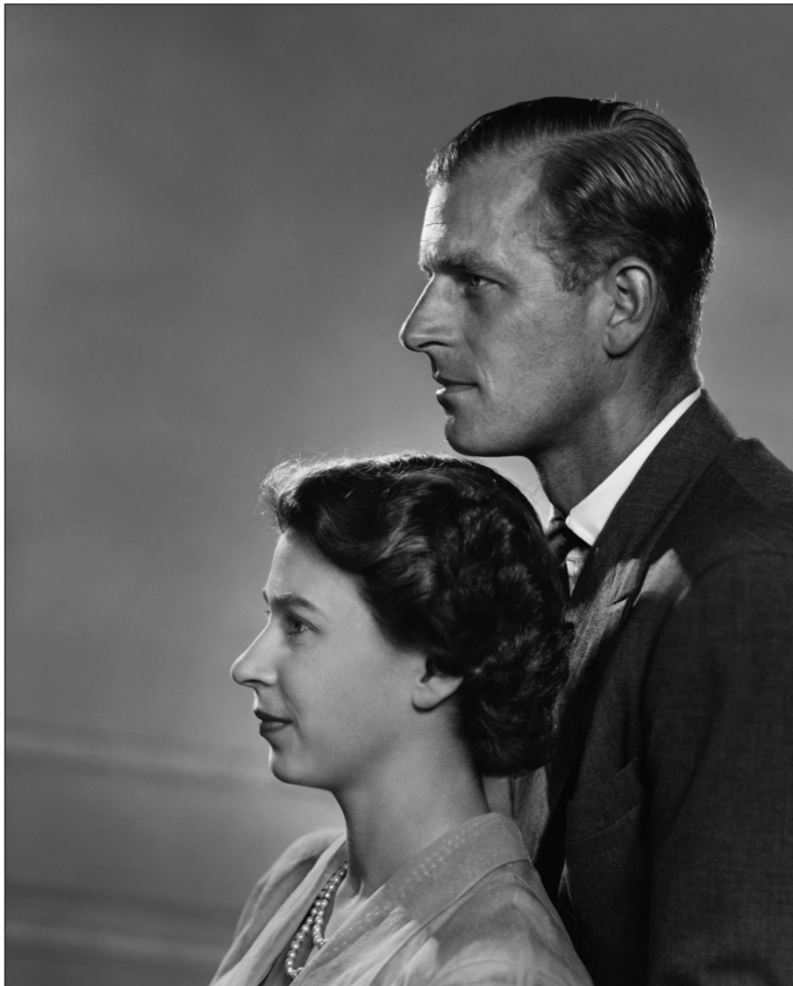
Queen Elizabeth II and Prince Philip in 1951.

"His generation equated service to country as service to values he believed in,"