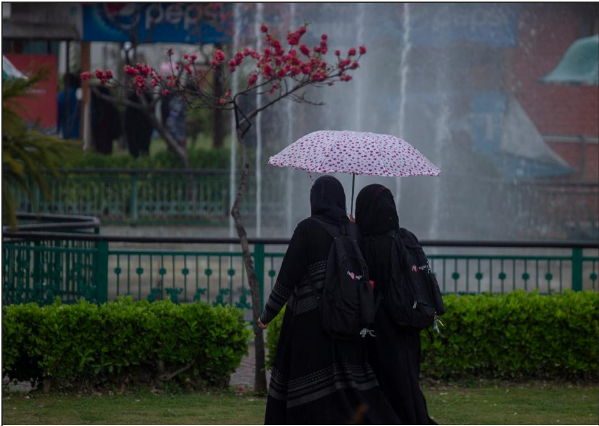
Two Abaya-clad students walk in a park on a rainy Tuesday in Srinagar.

“We want all teaching and non-teaching staff members, as well as their family members and relatives aged above 45 years, to join this vaccination drive in the remaining two days at the Health Centre along with their I-day proofs (Aadhar/PAN/I-card),” he said as per a statement. The drive started at 11 am.