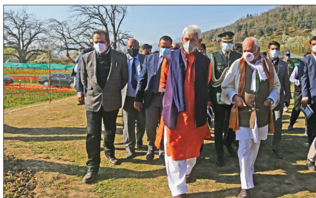
LG Manoj Sinha (Left) taking a walk inside Tulip Garden with Kerala Governor Arif Khan on Saturday.

He urged tourists and people of Kashmir to follow Covid