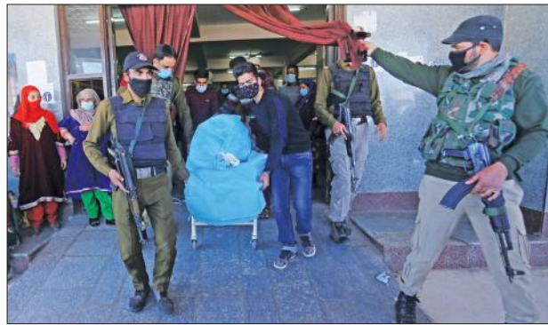
KO