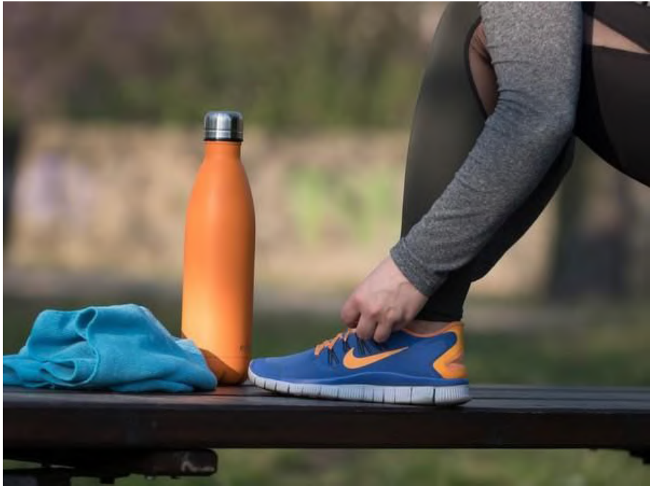
targets and dietary limits. In an analysis of data from participants of the Framingham Heart Study, which began more than 70 years ago in Framingham, Massachusetts, investigators examined data from 2,379 adults ages 18 and older and their

Following a routine of regular physical activity combined with a diet including fruits, vegetables and other healthy foods may be key to middle-aged adults achieving optimal cardiometabolic health later in life, according to new research using data from the Framingham Heart Study published in the Journal of the American Heart Association. Cardiometabolic health risk factors include metabolic syndrome, a cluster of disorders such as excess fat around the waist, insulin resistance and high blood pressure. The presence of metabolic syndrome may increase the risk of developing heart disease, stroke and Type 2 diabetes. Researchers noted it has been unclear whether adherence to both the US Department of Health and Human Services' 2018 Physical Activity Guidelines for Americans and their 2015-2020 Dietary Guidelines for Americans -- as opposed to only one of the two -- in midlife confers the most favourable cardiometabolic health outcomes later in life. The physical activity guidelines recommend that adults achieve at least 150 minutes of moderate or 75 minutes of vigorous physical activity per week, such as walking or swimming. The dietary guidelines, which were updated in January 2021, offer suggestions for healthy eating patterns, nutritional