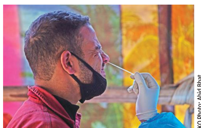
Press Trust Of India

SRINAGAR: At least 50 students of two schools in Kulgam and Anantnag districts of Jammu and Kashmir tested positive for COVID-19 on Wednesday, forcing the