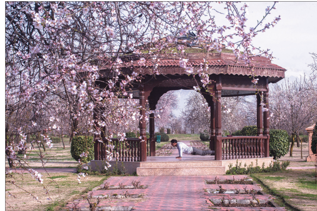
A man carrying out early morning exercise inside the blossomed Badamwari orchard in Srinagar on Wednesday.