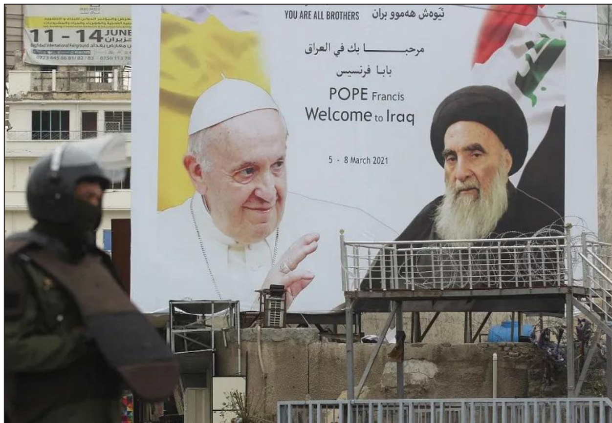
A poster of Pope Francis and Grand Ayatollah Sayed Ali al-Sistani is seen along a street ahead of the Pope's planned visit to Iraq, in central Baghdad on March 4, 2021

In 2005 Iraqi Christians campaigned for the Nobel Peace Prize for Ayatollah Sistani as a tribute to his relentless efforts to protect their lives and right to practice their faith following the Daesh onslaught. He was listed as the most influential intellectual in 2005. Rarely does al-Sistani weigh in on