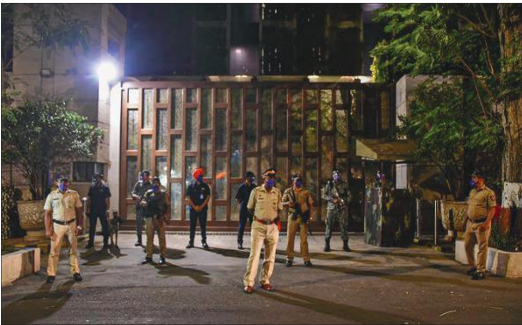
Police personnel guard industrialist Mukesh Ambani's residence Antilla after explosives were found in an abandoned car in its vicinity, in Mumbai.

The board exams last year had to be postponed mid-way in March. They were later cancelled and the results announced on the basis of an alternative assessment scheme.