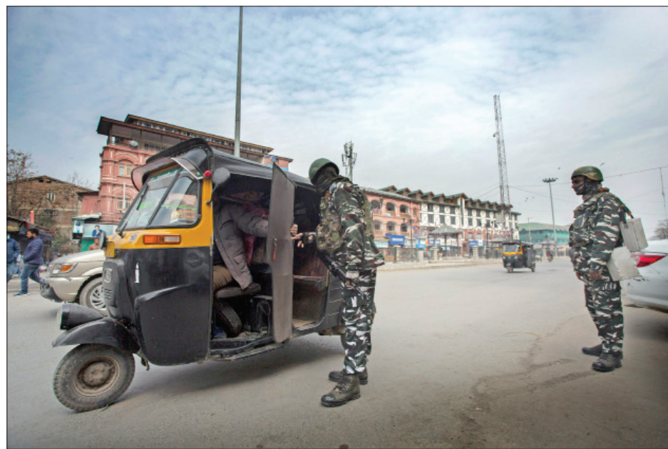
KO Photo: Abid Bhat

"Disposal of untreated sewage into the Dal Lake and Jhelum river is one of the main » More On P10