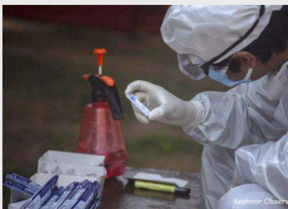
KO Photo And Bhat

Providing district-wise breakup, the Bulletin said that Srinagar has 26639 positive cases (including 42 cases reported today) with 272 Active Positive, 25907 recovered (including 15 cases recovered today), 460 deaths; Baramulla has 8167 positive cases (including 02 cases reported today) with 35 Active Positive, 7959 recovered (including 15 cases recovered today), 175 deaths; Budgam reported 7835 positive cases (including 09 cases reported today) with 39 active positive cases, 7678 recovered (including 06 cases recovered today), 118 deaths; Pulwama has 5803 positive cases (including 06 cases reported today) with 37 Active Positive, 5678 recovered (including 05 cases recovered today) and 88 deaths; Kupwara has 5672 positive cases (including 01 case reported today), 05 Active Positive, 5571 recoveries (including 02 cases recovered today), 96 deaths; Anantnag district has 4973 positive cases (including 09 cases reported today) with 44 Active Positive, 4843 recovered (including 03 cases recovered today), 86 deaths; Bandipora has 4705