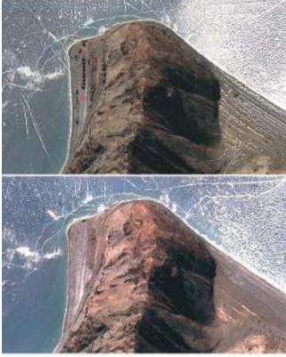
became a flashpoint in the prolonged border dispute. Satellite imagery of some areas on the northern bank of Pangong

NEW DELHI: Last week, the nuclear-armed neighbours announced a plan to pull back troops, tanks, and other equipment from the banks of Pangong Tso, a glacial lake in the Ladakh region China has dismantled dozens of structures and moved vehicles to empty out entire camps along a disputed Himalayan border, where Indian and Chinese troops have been locked in a face-off since last summer, satellite images released on Wednesday show. The nuclear-armed neighbours last week announced a plan to pull back troops, tanks, and other equipment from the banks of Pangong Tso, a glacial lake in the Ladakh region, that