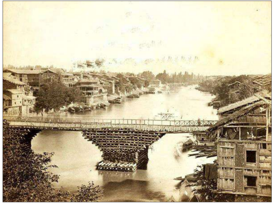
less bridge over the Tsunt Kol.