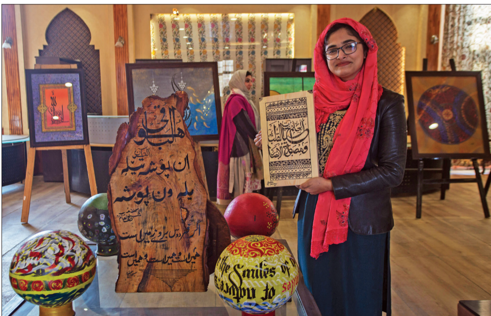
An artist displays her work on the inaugural day of fine arts exhibition at Srinagar's TRC on Tuesday.