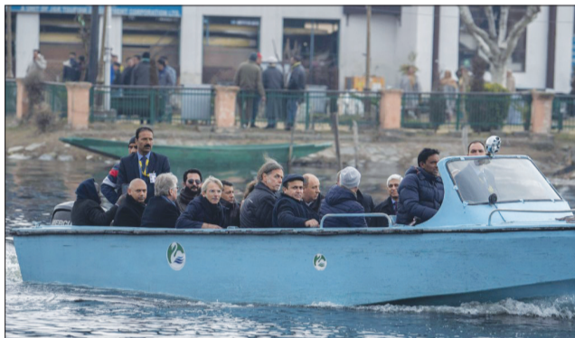
Foreign Envoys take a boat ride on Dal Lake in Srinagar