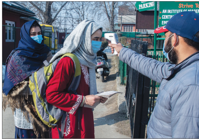
KO Photo: Abid Bhat

"It has been one freaking time away from my classroom,"