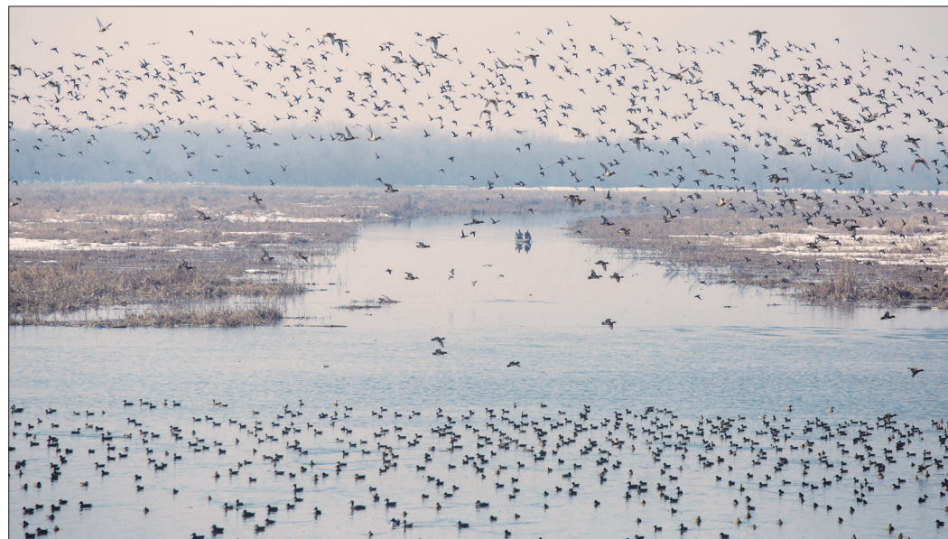
KO lensman Abid Bhat captures a view of Hokersar wetland which is abuzz after the arrival of migratory birds this winter.