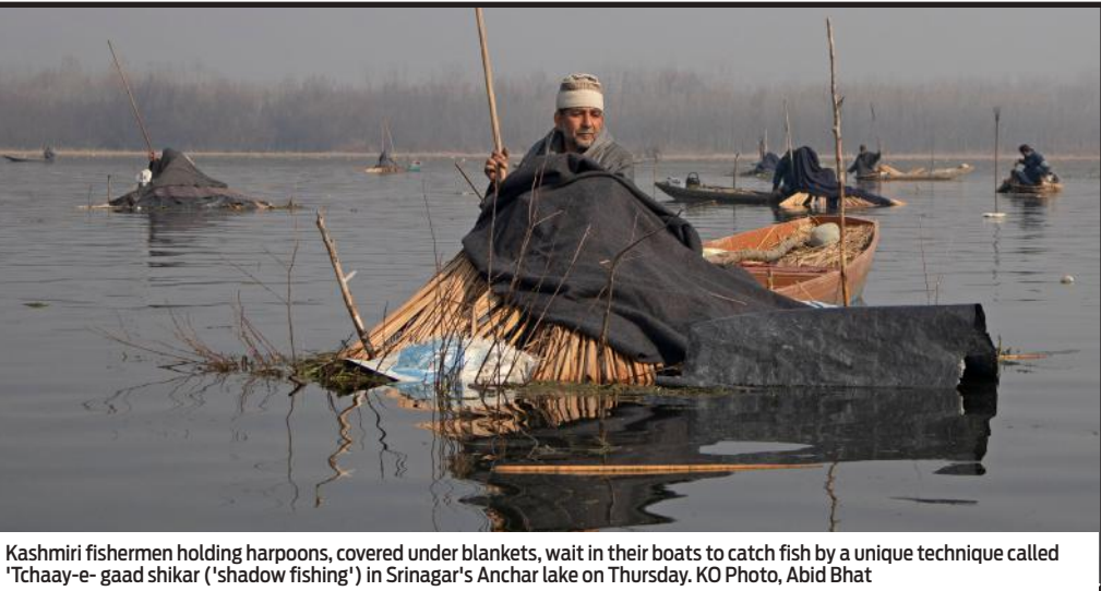
Kashmiri fishermen holding harpoons, covered under blankets, wait in their boats to catch fish by a unique technique called "Tchaay-e-gaad shikar ('shadow fishing') in Srinagar's Anchar lake on Thursday.