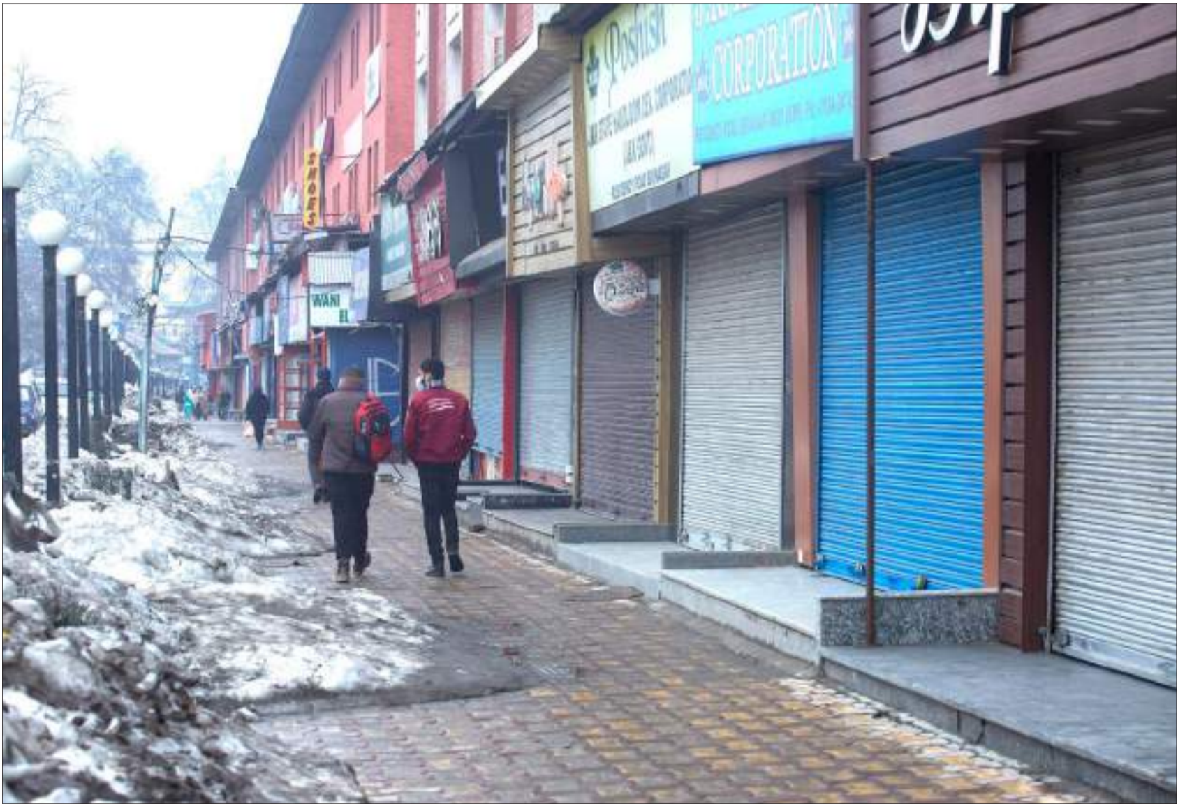
PARTS OF SRINAGAR CITY OBSERVED A SHUTDOWN to mark the 8th execution anniversary of Mohammad Afzal Guru on Tuesday. Eye witnesses said shops and business establishments in the parts of city including commercial hub Lal Chowk remained shut and transport was thin on roads. Guru was hanged in Tihar jail on February 9, 2013, and his remains were not handed over to his family.