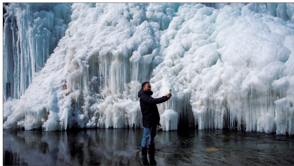
Consistent frigid temperatures have turned famous Drang waterfall near Tangmarg into an icy wall attracting hordes of visitors to watch the nature's spectacle.

night's low of minus 6.3 degrees Celsius, they said. Pahalgam tourist resort in south Kashmir, recorded a low of minus 5.3 degrees Celsius, up from minus 7.5 degrees Celsius the previous night. The minimum temperature at the Gulmarg skiing resort, in north Kashmir's Baramulla district, settled at minus 2.5 degrees Celsius last night, an increase of four degrees from the previous night, the officials said. They said the night temperature at the resort was 4.2 degrees above normal for this time of the season. Kupwara town >> More On P2