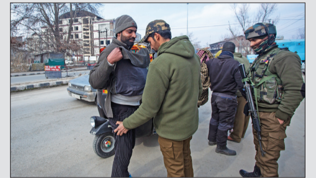
The Govt forces have increased random security checks and frisking in Srinagar in wake of recent militant attacks