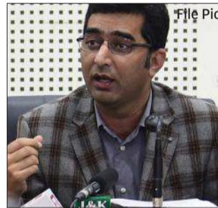
the meeting will be held at 11 am on 6 February 2021 in the Meeting Hall of DC Office Srinagar.

The notification issued in pursuance of sub-rule (4) of rule 108-ZN of the Jammu & Kashmir Panchayat Raj Rules 1996 states that