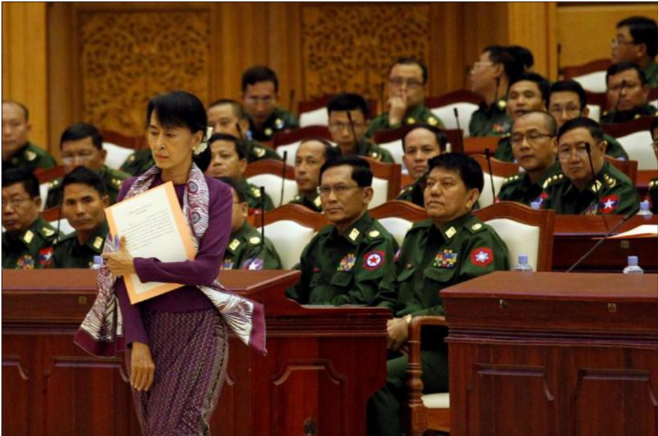
FILE PHOTO: Pro-democracy leader Aung San Suu Kyi walks to take an oath at the lower house of parliament in Naypyitaw May 2, 2012

Scientists are required to be an active researcher in a university or research centre or in the private sector, with a practical experience of not less than 10 years in the same field. They also should have contributions in the scientific field such as winning a prestigious scientific award, or securing substantial funding for their research during the past ten years, it is also mandatory to obtain a recommendation letter from recognised scientific institutions in the UAE.