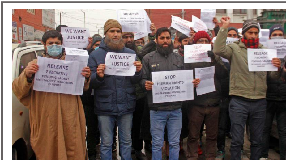
Terminated teachers of Muslim Educational Institute (MEI), Pampore protest in Srinagar demanding their reinstatement.

Meanwhile, Police have taken the cognizance of the incident and have registered a report in this regard and further investigations have been taken up.