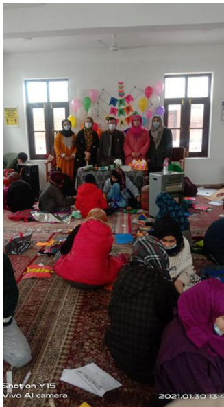
to serve the community at the grassroots level as envisaged in the NEP-2020.