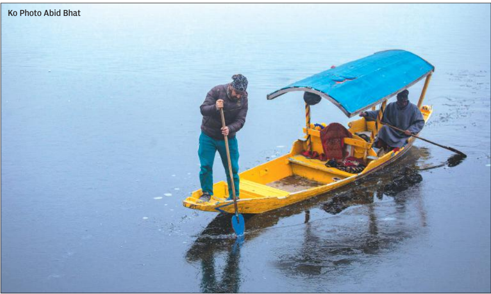
Ko Photo Abid Bhat

There are more than 4500 registered Shikaras owners. However, at present less than 800 are associated with it as others have switched to other