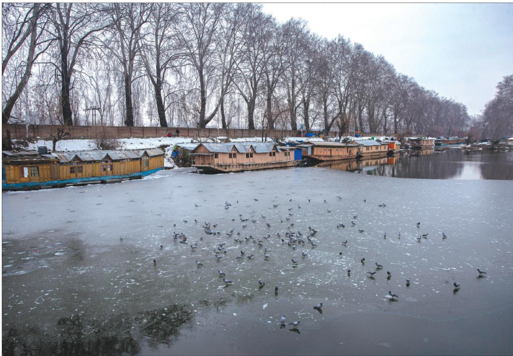
AS KASHMIR shivers with escalating cold, Dal Lake has become a freeze frame for onlookers.