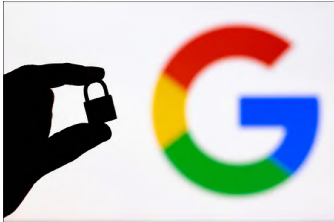
to official government departments and agencies”.