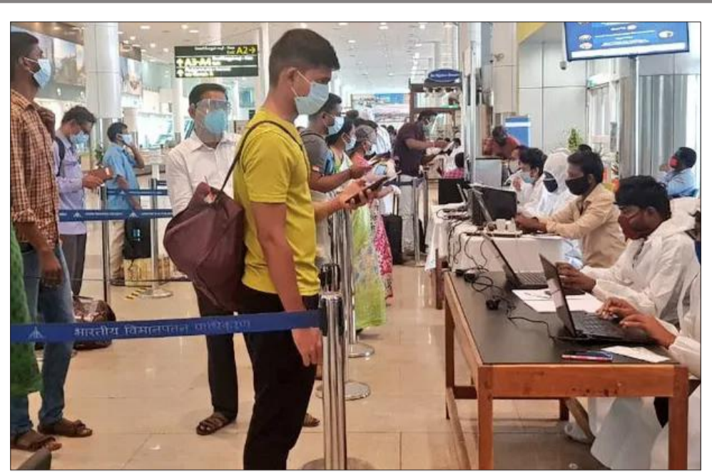
International tourist arrivals fell by one billion, or 74 percent, in 2020. (Representational)

Gold buying by central banks slowed sharply in 2020, 59 per cent lower at 273 tonne.