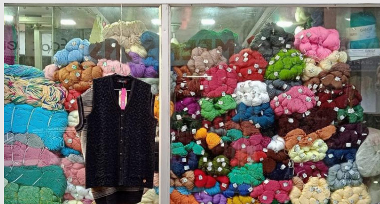
mufflers and socks safely in my cupboard," she says. While affectionately holding a red muffler in her hand, she adds, "every time I see them, they fill me up with love for my Didi."

her childhood, when long needles embedded in colourful wool balls would be found in almost every Kashmiri home. The knitting culture would assemble women for chitchats in the evenings. Back then, hand-knitted mufflers or sweaters would be exchanged as gifts. They were preserved like amulets by people as the interwoven threads were symbolic to the makers of love and affection.