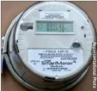
The DGM further informed that a second lot of 1000 smart meters are in the pipeline of being supplied and are expected to reach Srinagar by 29th Jan 2021. MD KP-

DGM, RECPDCL informed that 200 smart meters stand installed at Peerbagh locality of Srinagar. The DGM further informed that the installed smart meters will be integrated with the Data Centre servers at Bemina, which have already been installed.