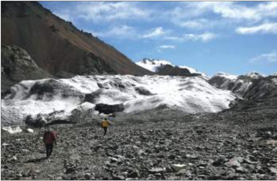
USING SATELLITE DATA, the experts found the Earth lost 28 trillion tonnes of ice between 1994 and 2017