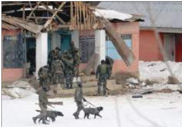
Soldiers inspect the site of IED explosion in Subhanpora area of Kulgam district on Wednesday.

In a statement issued here this evening, a police spokesperson said that the preliminary investigation have revealed that a rudimentary IED with a low powered explosive and ball bearings was planted in an abandoned building inside the school premises, where the soldiers used to