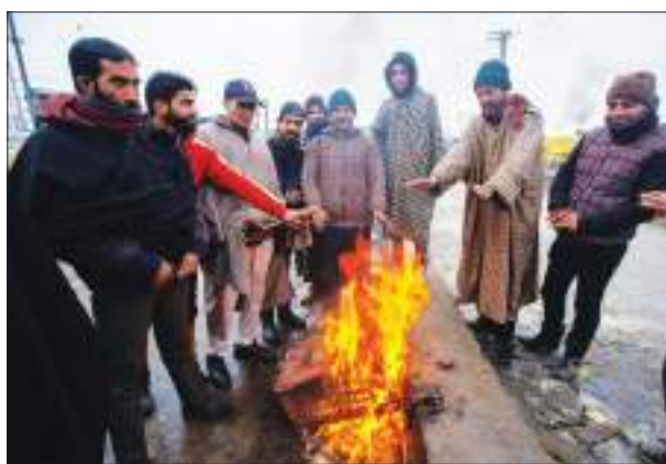
KO Photo: Abid Bhat

Meanwhile, the minimum temperature in Kashmir