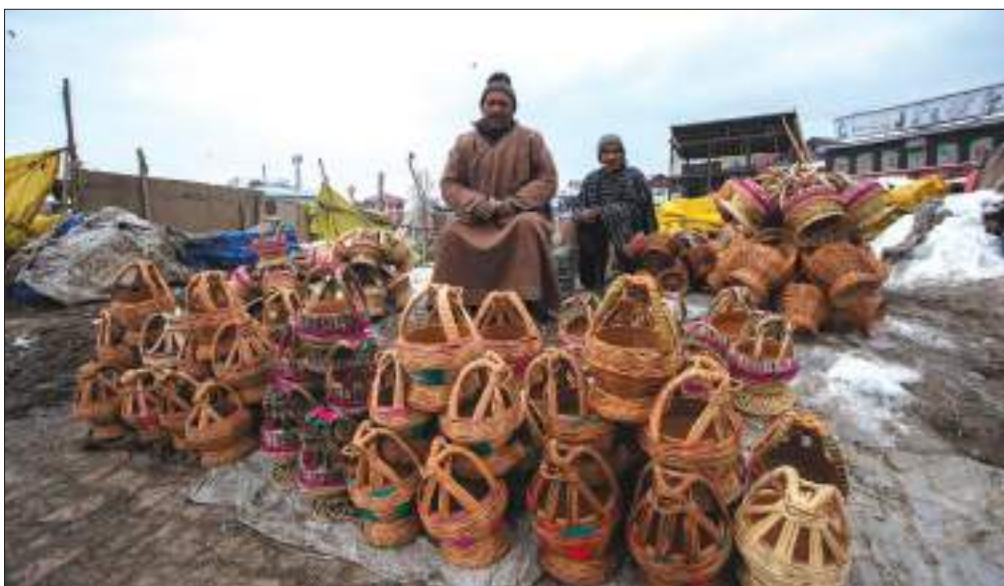
TWO VENDORS selling Kashmiri firepots (Kangri) on a roadside in Batamloo area of the city on Wednesday.

THE MASKED MEN COULD BE SEEN roaming at night in CCTV footage which is in possession of some of the victims. They could be seen snapping the main power supply before entering any particular house. They burgled two houses in two consecutive days in Shaheen colony recently."