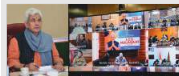
Lt Governor Manoj Sinha held the 4th run of LG's Mulaqaat with applicants through videoconferencing on Wednesday. Grievances were redressed on the spot during two-hour long Live Public Grievance Hearing.