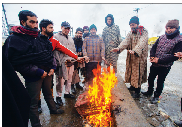
KO Photo: Abid Bhat

Meanwhile, the minimum temperature in Kashmir