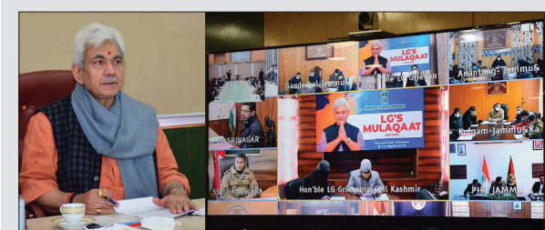
Lt Governor Manoj Sinha held the 4th run of LG's Mulaqaat with applicants through videoconferencing on Wednesday. Grievances were redressed on the spot during two-hour long Live Public Grievance Hearing.

The petitioner sought a direction to the administration to treat them as Government employees and, consequently, entitled to ● More On P10