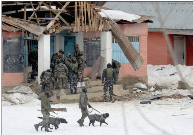
Soldiers inspect the site of IED explosion in Subhanpora area of Kulgam district on Wednesday.

In a statement issued here this evening, a police spokesperson said that the preliminary investigation have revealed that a rudimentary IED with a low powered explosive and ball bearings was planted in an abandoned building inside the school premises, where the soldiers used to