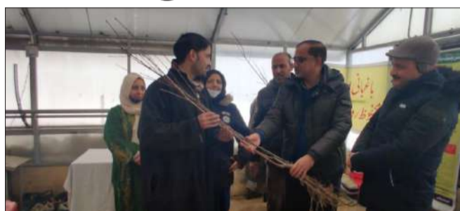
sion to ensure wide publicity of the scheme through electronic and print media so that people can avail benefits under this scheme. The Director also briefed growers about the benefits under the newly launched schemes viz. 'Operation Greens- Top to Total' and PM Formalization of Micro Food Processing Enterprises (PM FME) as part of

He also instructed Chief Horticulture officers of the Kashmir Divi-