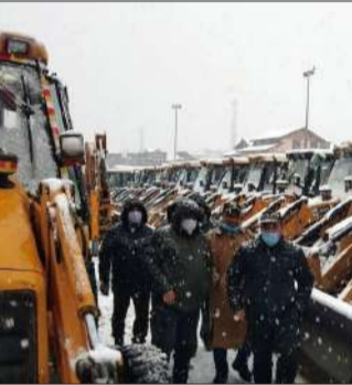
He further passed on directions that all the 74 machines will be stationed at wards only so that in case of continuous heavy snowfall the machines will be constantly put to operational mode for swift removal of snow.

Mayor directed the concerned to immediately go for clearance of important stretches leading to hospitals, religious places, main roads and other vital des-