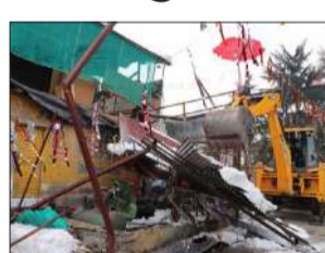
go for any sort of illegal constructions/ encroachments, without obtaining proper building permission from the competent authority. It was given out that strict action in terms of conducting demolitions followed by lodging of FIR's shall be taken against violators who try to raise the constructions in the In-Lake / Green Belt areas.

Meanwhile, the public residing within the LDA jurisdiction and in the lake are hereby directed not to