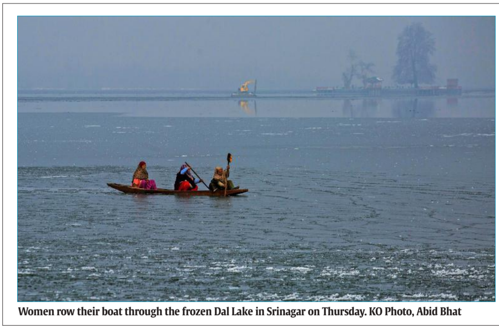
Women row their boat through the frozen Dal Lake in Srinagar on Thursday.