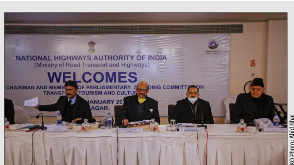
KO Photo: Abid Bhat

Jammu and Kashmir recorded 5,100 instances of ceasefire ● More On P10