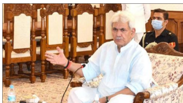
Director General Foreign Trade, Divisional Commissioner Jammu/Kashmir, ● More On P10

AMONG OTHERS, THE BOARD HAS BEEN TASKED to select and manage the areas to be declared as Export Promotion Hubs in the J&K. It is to finalize the Export Policy/Strategy formulated by the Apex level Export Promotion Committee constituted by the Government on 25 June 2020.