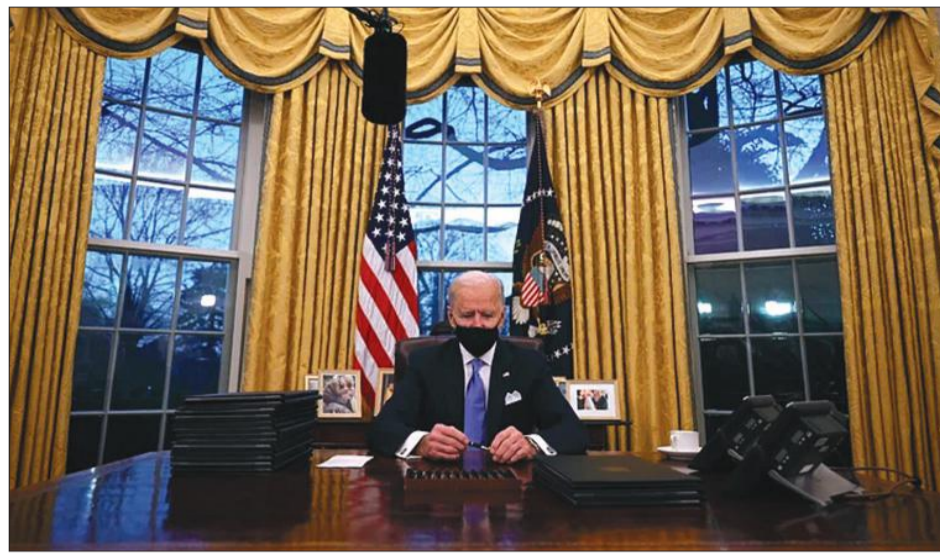
US PRESIDENT JOE BIDEN holds a pen as he prepares to sign a series of orders in the Oval Office of the White House in Washington, DC, after being sworn in at the US Capitol on January 20, 2021

The announcement follows months of bargaining between Google, French publishers and news agencies over how to apply revamped EU copyright rules, which allow publishers to demand a fee from online platforms showing extracts of their news.