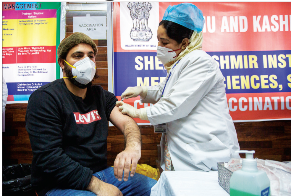
A health worker being administered Covishield vaccine at SK institute of medical sciences (SKIMS) Srinagar on Saturday.